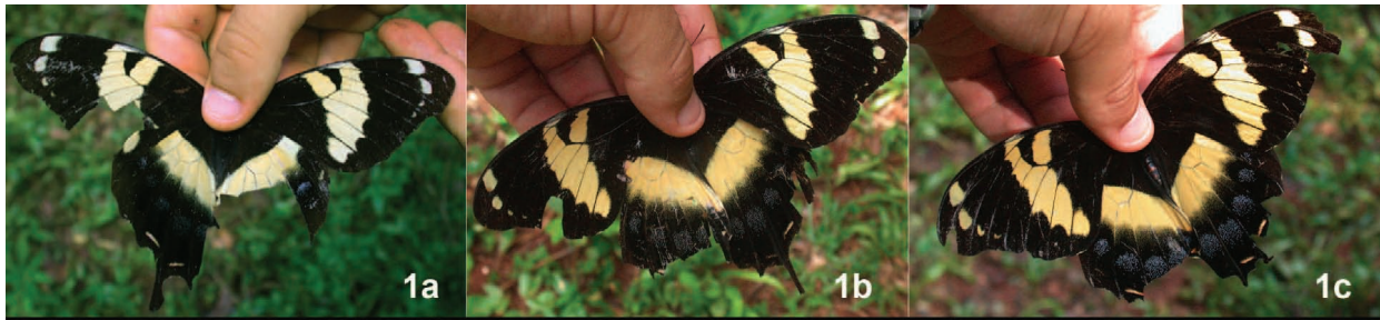
FIG. 1. Photographs of Papilio homerus used for image analysis. From left to right, photograph #3889, 4060, and 3794.

used to outline the wing as the presumed shape of an undamaged wing while erasing the remainder of the background. The image was cleaned using the Erase tool so that only the wing remained for analysis. Photographs of undamaged wings were used as a template when outlining the presumed shape of an undamaged wing on a wing with damage. The image was then saved as an undamaged wing JPEG file as a high quality image (10) with the format option set as baseline standard. The undamaged wing file was reopened and the Erase tool was used to outline the actual damaged wing, which was then saved as a damaged wing JPEG file. Both images were grayscaled by selecting the Image tab, then choosing the Mode option, which leads to the Grayscale option. The grayscaled images were saved as TIFF files.