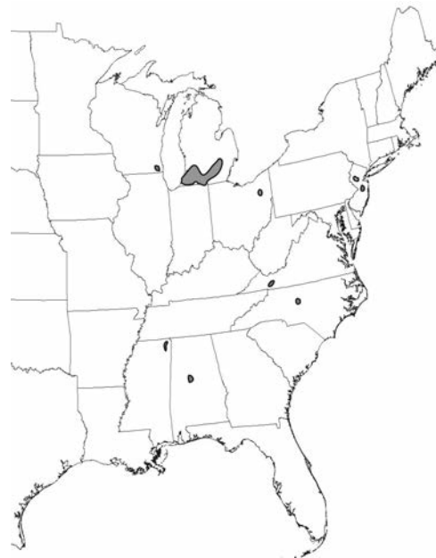
FIG. 2. Map highlighting the locations of N. mitchellii including both extant and extirpated populations. Extirpated populations are found in Wisconsin, Ohio, and New Jersey.

In 1983, a single population of butterflies, which appeared phenotypically similar to the Mitchell's satyr, was discovered on the Fort Bragg Military Reservation in North Carolina. Further exploration uncovered a