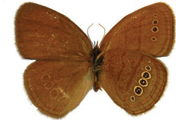
FIG. 1. Dorsal (left) and ventral (right) wing pattern from the right wing of a male N. mitchellii specimen collected at the Kellogg Biological Station in 1953. This population was extirpated in the 1960s.

and the average female two to four days (Szymanski et al. 2004).