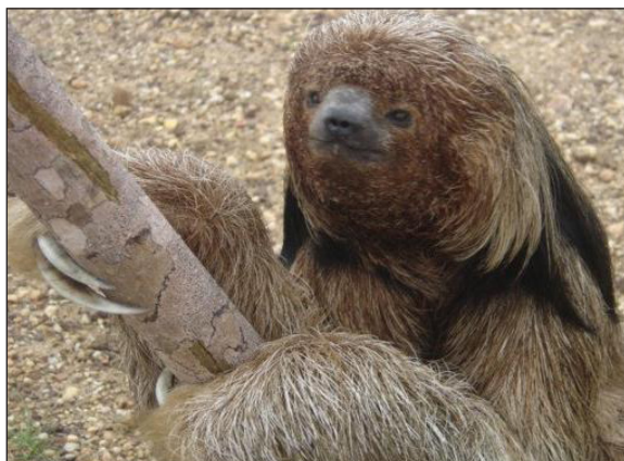
Figure 2. Adult Bradypus torquatus from Fazenda Trapsa, Sergipe, Brazil.

Additionally, at least two sloths are known to have been captured by local residents during the past year