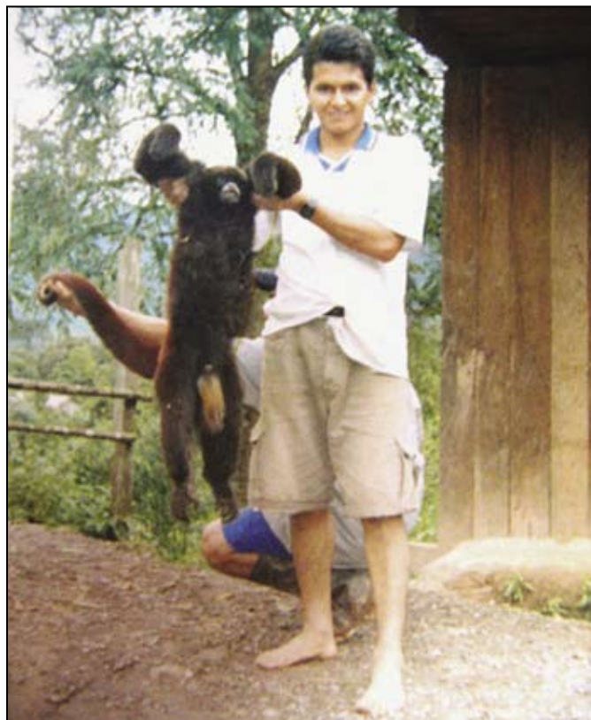
Figure 3. A farmer poses with a recently killed adult male Oreonax flavicauda , near the settlement of Afluente (Alto Mayo), Peru.

The campesinos of this area, and in all areas in the Bosque de Protección, are immigrants, former cerranos (people from the sierras) who fled to the area during the height of guerilla activity (mostly the Sendero Luminoso) during the 1970s and 80s. The prospect of free and unoccupied terrain enticed them further still and stimulated a greater influx that is still growing at an exponential rate. Most of the occupation occurred before the Bosque de Protección was decreed in 1987, but settlers continue to migrate to the area. As a result, the Department of San Martín has the third highest population growth rate in the country (4.7% over 10 years: Instituto Nacional de Estadística e Informática [INEI]—Estimaciones de Población por Departamentos, Provincias y Distritos, 1995–2000; San Martín, Peru).