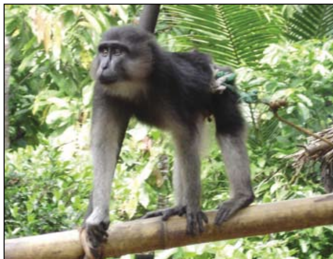
Figure 2. Pet juvenile male booted macaque ( Macaca ochreata ) in the village of Non Blok, South Sulawesi. Note the white/grey forearms and hindlimbs.

The estimates of group density of M. ochreata (range 0.97–2.0 per km 2 ) obtained in our study are lower than those found for other species of Sulawesi macaques: M. tonkeana