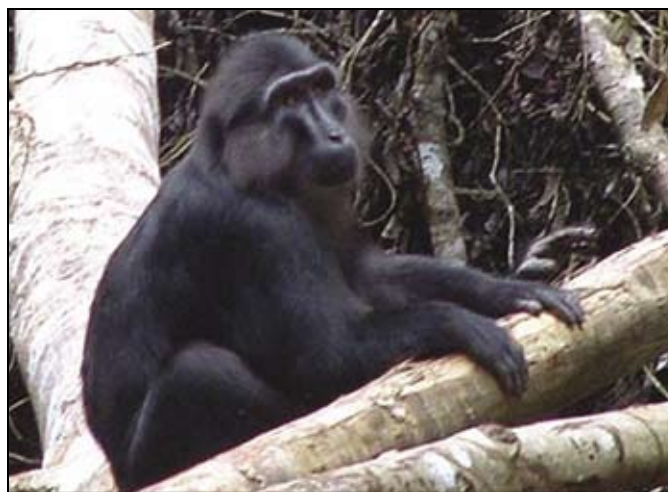
Figure 3. Adult male Tonkean macaque ( Macaca tonkeana ) from Lore Lindu National Park, Central Sulawesi. Note the all black body, including limbs and trunk.