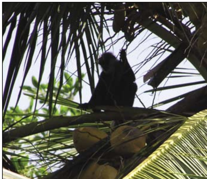
Figure 3. A juvenile western purple-faced langur, Trachypithecus vetulus nestor , resting in a coconut palm.

to be taking place more rapidly in the eastern than the western half, and these reductions suggest the occurrence of local extinctions. For instance, although Hill (1934) mentioned T. v. nestor 's presence several decades ago at localities such as Kitulgala and Ruwanwella, it was recorded as absent at these sites during the survey. Moreover, the sites in the eastern half where it was seen or recorded as present during interviews were interspersed between areas where it was absent or rare. Hence, the status of T. v. nestor at the sites surveyed (i.e., present, absent or rare) also suggests the occurrence of local extinctions. Local extinctions in the western half appeared to be mostly along the north-east boundary where it may have occurred in low numbers in the first place, but local extinctions in the eastern half appear to have progressed well inside its former haunts (Fig. 1, inset).