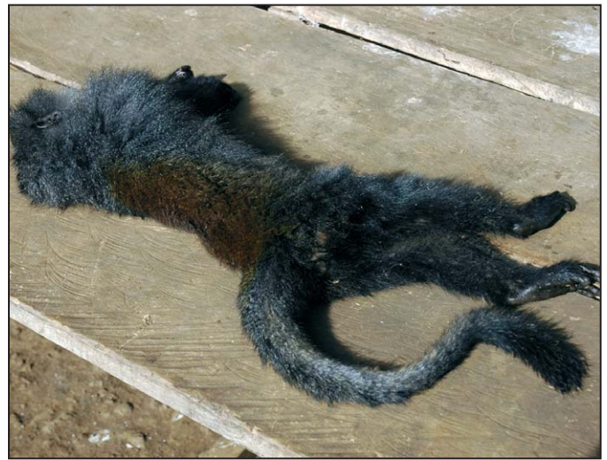
Figure 4. Bioko Preuss's monkey Allochrocebus preussi insularis for sale at the Malabo (‘Semu’) Bushmeat Market, Bioko Island, Equatorial Guinea. This is an Endangered species (IUCN 2009) which is represented on Bioko by an endemic subspecies. Note the short tail which is characteristic of this subspecies. All five of Bioko's threatened species of monkey are sold at this market. No fewer than 2,940 monkeys were sold here during the first 6 months of 2009.