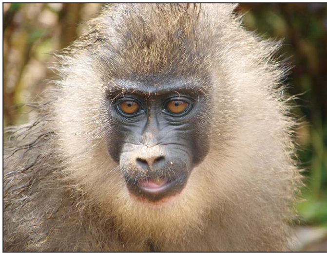
Figure 3. Juvenile Bioko drill Mandrillus leucophaeus poensis . This is an Endangered species (IUCN 2009) which is represented on Bioko Island, Equatorial Guinea by this endemic subspecies. This is the preferred prey of the commercial bushmeat hunters on Bioko. The total number of drills on Bioko as of 2009 is unlikely to be more than 4,000. A photograph of an adult male Bioko drill appears on the front cover of this issue of Primate Conservation .

Unfortunately, red colobus and black colobus Colobus satanas are usually eviscerated by hunters soon after being shot. For these two species the weights of the eviscerated