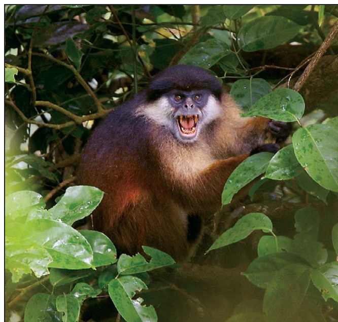
Figure 2. Adult male Bioko red colobus Procolobus pennantii pennantii . This is a Critically Endangered species (IUCN 2009) and one of five threatened species of monkey on Bioko Island, Equatorial Guinea. This subspecies is limited to the southern-western corner (ca. 20%) of Bioko Island.