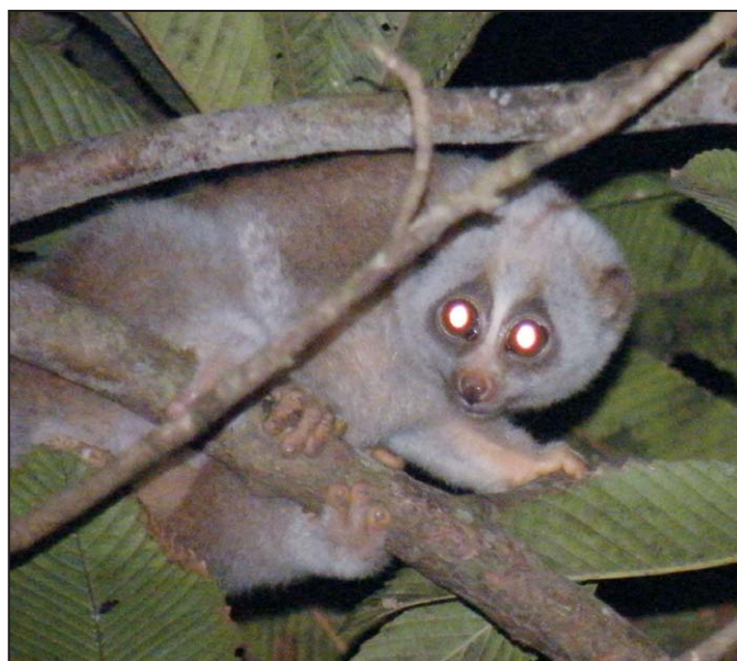
Figure 1. Bengal slow loris, Nycticebus bengalensis , in the state of Meghalaya, northeast India.

We obtained information on the presence of Bengal slow loris ( Nycticebus bengalensis ) through field surveys and secondary sources of information. Night transects were conducted along established human and animal trails, roads, streams, and rivers. In the case of paved roads passing through the forest, we used four-wheel-drive vehicles driven slowly (<5 km/hr), most especially in areas with high numbers of rogue elephant incidents. Once, we used a boat to survey forests along the river, as it provided the best access in that terrain.