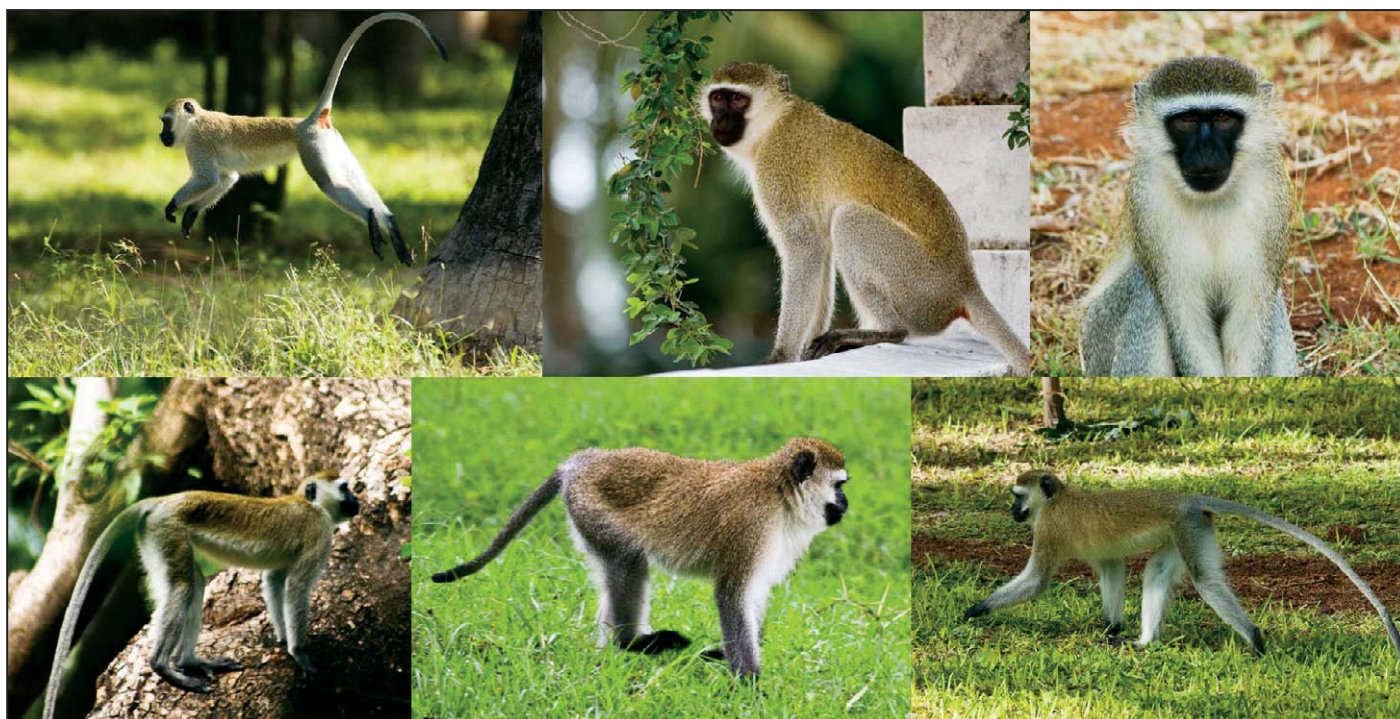
Figure 4. Chlorocebus pygerythrus ‘ hilgerti ’ adult males over the geographic range in Kenya and Tanzania surveyed during this study. Top row , left to right: Malindi, northern coast of Kenya; Majengo, north of Mombasa, southern coast of Kenya; Tanga, northern coast of Tanzania. Bottom row , left to right: South Horr, north-central Kenya; Lake Naivasha, south-central Kenya; Lake Manyara, north-central Tanzania.

We are grateful to Primate Conservation Inc., the Margot Marsh Biodiversity Foundation, the Primate Action Fund, and the Critical Ecosystem Partnership Fund at Conservation International for financial support. We acknowledge the Kenya Ministry of Education, Science & Technology (permit 13/001/33C 283) and the Tanzania Commission for Science