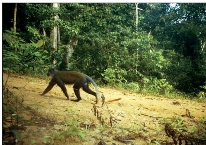
Figure 4. Cercopithecus solatus photo taken using camera trapping, close to Mount Mimongo.

Fifteen camera traps were deployed in a 30-km 2 study area over 54 days between 28 August and 21 October 2004 in an area about 10 km to the south of the southern bank of the Lolo River. No images of C. solatus were obtained. This indicates that the species is either absent or very rare south of the Lolo River. Lauren Coad and local field assistants conducted a hunting study from January 2004 to January 2005 in the same area in two villages, Dibouka (01°19'07"S, 12°12'54"E) and Kouagna (01°18'28"S, 12°13'45"E). Their results showed considerable hunting pressure that was highest within 5 km from the villages, but also extended up to hunting camps 12 km to the north, on the southern bank of the Lolo. During this study all hunting returns for the two villages were recorded, and no C. solatus were ever caught or seen. During a previous hunting study in these villages conducted by Malcolm Starkey from 2000 to 2002, no C. solatus were