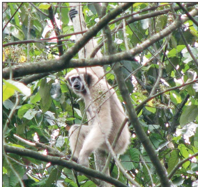
Figure 2. Adult female eastern hoolock gibbon, Hoolock leuconedys .