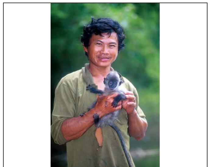
Figure 2. Captive young Indochinese silvered leaf monkey Trachypithecus germaini , showing characters of ‘ margarita ’, beside the Xe (= River) Pian, Xe Pian National Protected Area, December 2000.

The morphology of the animals in Dong Phou Vieng NPA was checked carefully in August 2010 against features in Nadler et al. (2005). The animals were seen well (for about ten minutes spread across half an hour, at 150–200 feet range) and resembled closely ‘ margarita ’ as portrayed in Nadler et al. (2005; Figs 6 and 12). Specifically, the feet, hands and lower arms (but not the legs) were blackish, contrasting strongly with the gray body; this was much paler ventrally