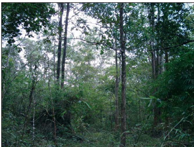
Figure 3. Habitat typical of T. germaini : level lowland forest with open canopy. Ban Vangsikeo, Dong Phou Vieng National Protected Area; 6 November 2007.

Most of the modern records come from lowland plains: the two highest confirmed sites are at only 550 m and 340 m (Appendix). The historical specimen location of Ban Phon (Table 1) is amid lowland habitat typical of modern records. Hunters' reports suggest this monkey can live up to 1,200 m or so in Xe Sap NPA (Appendix), but cannot be taken as proof of this. Even if gray leaf monkeys do occur in these hills, it cannot be discounted that they are Phayre's leaf monkeys unexpectedly far south. Indeed, J.-P. Pédrone (verbally 2010), long-term resident in Lao PDR, said that a leaf monkey was locally common on the Bolaven plateau, in the evergreen forest on the higher mountains, during 1956–1961 when he lived on a farm there. However, he recalled this monkey, which is not represented in his hunting photographs, as blue-gray in pelage and with prominent pale spectacles, characters better fitting Phayre's than the Indochinese silvered. Two 1990s claims of Indochinese silvered leaf monkeys from the Lao mountains were identification errors (see "Methods"), and while the identity of the historical "Bolaven" specimen as Indochinese silvered is not in doubt, it cannot be taken as evidence of highland occurrence. Even its rough altitude cannot be inferred, because the expedition in question in this