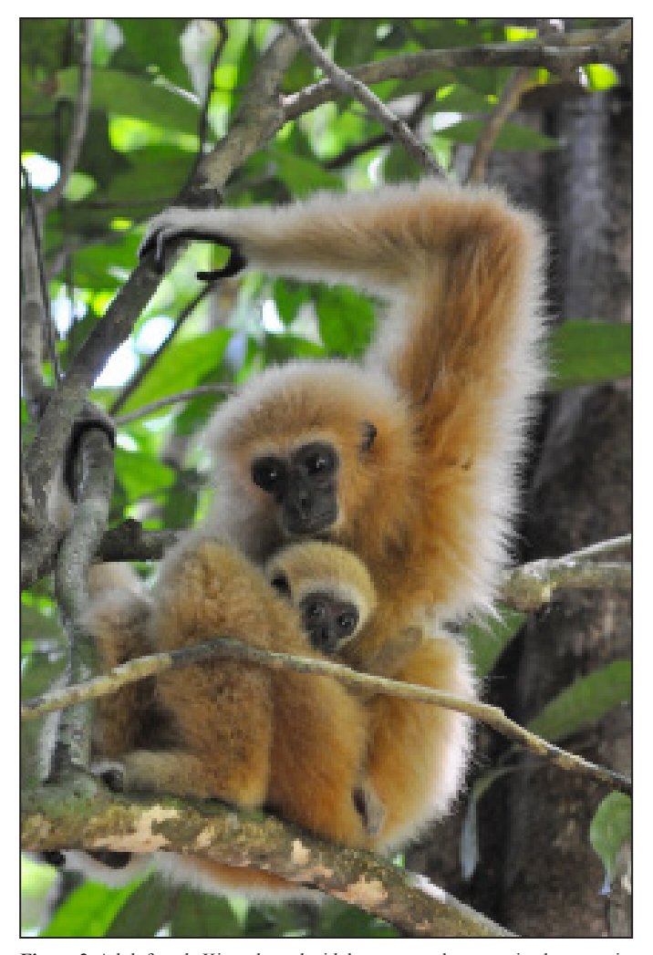
Figure 2. Adult female Kip, released with her mate and one captive born son in 2002, pictured with her third wild-born offspring Omyim in 2010.

Kip's family consisted of the bonded pair and their 2-year-old son at the time of release on 5 October 2002. The adult pair has remained together and has to date raised three wild-born babies past infancy in the wild (Fig. 2). Their captive-born son was translocated from KPT in 2012. The first wild-born baby in Kip's family, named Hope, dispersed from