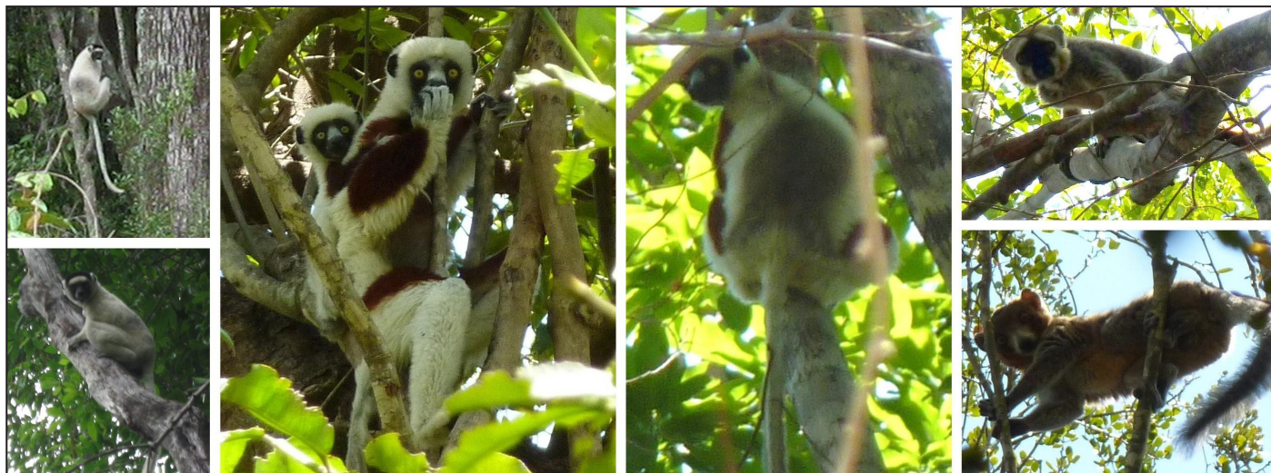
Figure 4. P. verreauxi at Analakinganala, P. coquereli at Betonendry/Maroakanga, Eulemur rufus at Ikay, and E. mongoz at Anaboazo.