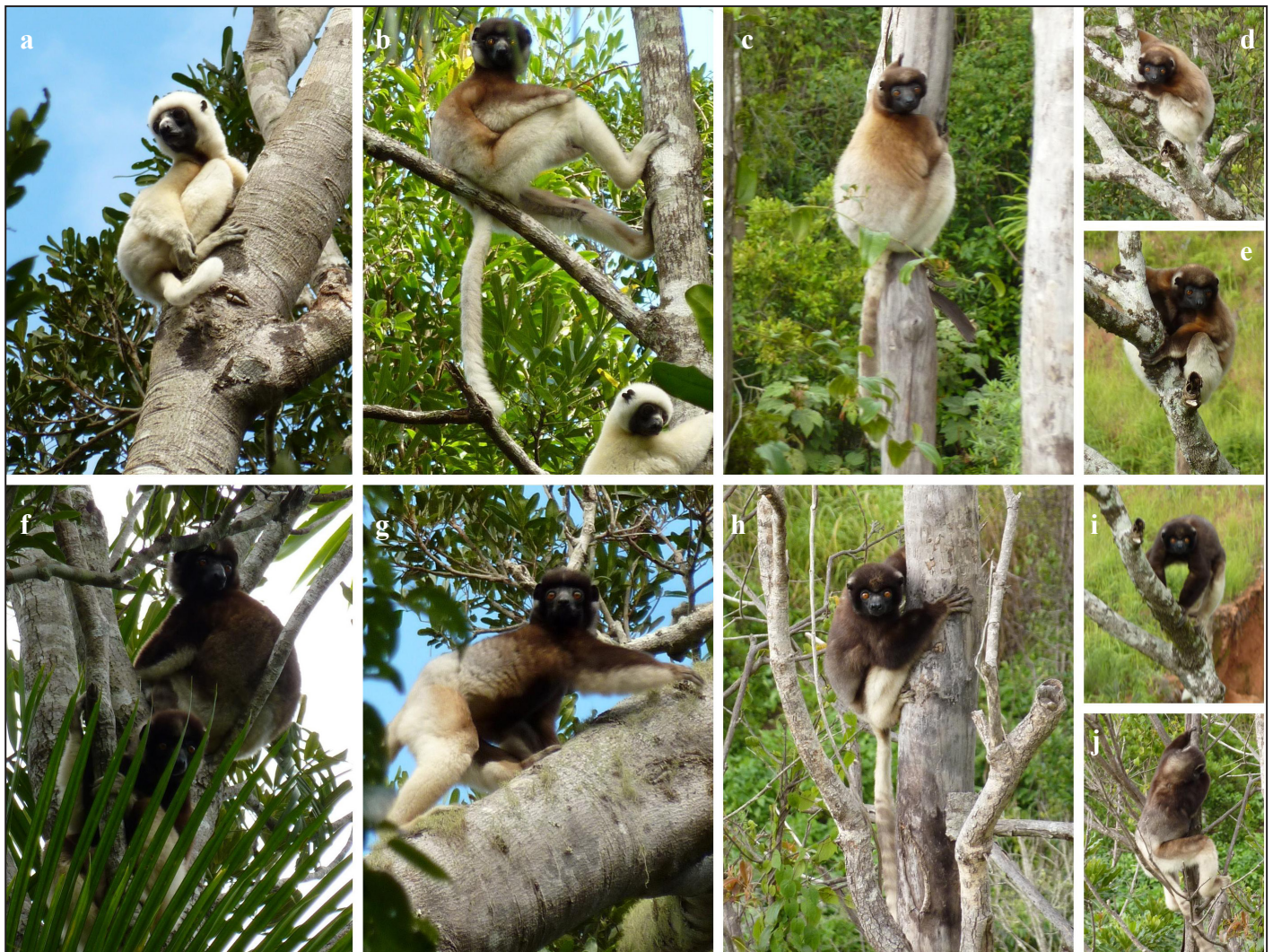
Figure 3. Chromatic variation of sifaka at the Orimbato site, including typical white P. deckenii (a and b), forms that we refer to as intermediate melanistic forms of which some resemble P. coronatus (b–e), and very dark melanistic forms which resemble neither P. deckenii nor P. coronatus (bottom line).