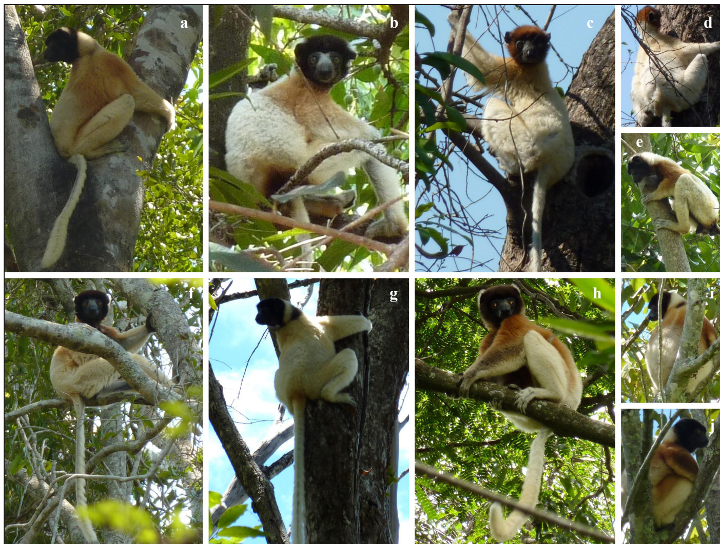
Figure 2. Chromatic variation of P. coronatus at the survey sites from the Boeny and Betsiboka regions (top line) and the Bongolava Region (bottom line): Anaboazo (a), Ikay (b and e), Mandrava (c and d), Ambohitromby (f), Mahajeby (g) and Andasilaikatsaka (h-j).