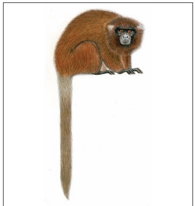
Figure 3. Revised illustration for C. olallae . Illustration by Stephen D. Nash.