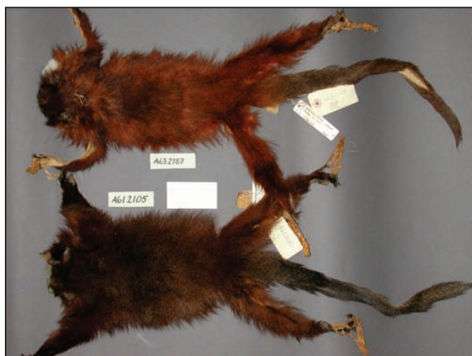
Figure 6. Photograph of original specimens of C. olallae (No. A632187) and C. modestus (No. A612105).

Callicebus modestus and C. olallae are currently classified as Vulnerable in the IUCN Red List of Threatened Species (Rylands and Tarifa 2003). At present, both species are known only from single localities. The original population of C. olallae found at the type locality La Laguna is presumably extinct due to hunting. Given their apparently restricted and patchy distribution, and the threat they face from over-hunting