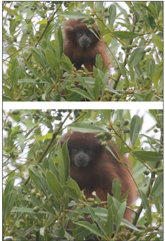
Figure 2. Photographs of wild titi monkeys matching the original descriptions for C. olallae .