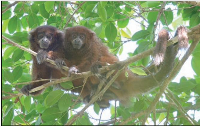
Figure 4. Photograph of wild titi monkeys matching the original description for C. modestus .