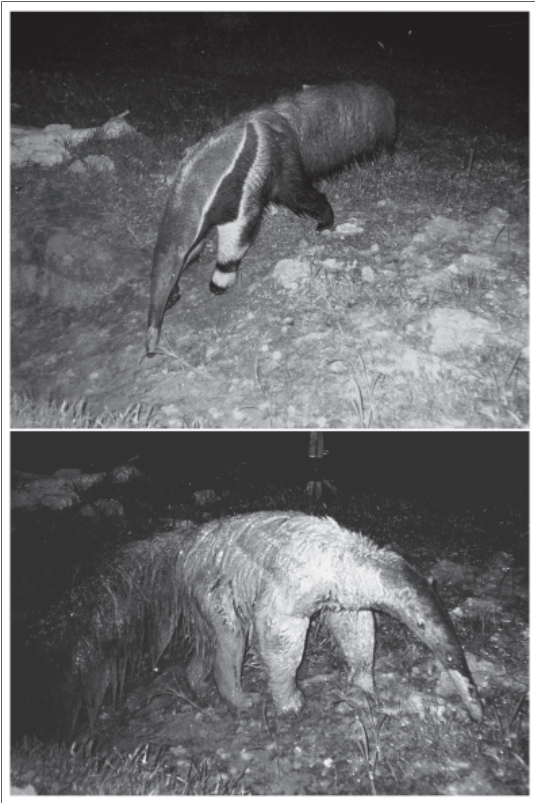
FIGURE 1. Giant anteater approaching the waterhole, 10 October, 2004, at 00:23 h (above); and the same animal leaving the waterhole, 00:31 h (below).