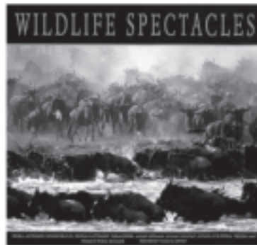
Available in English and Spanish