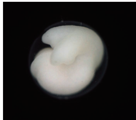
Fig. 2. A two-headed (bicephaly) lamprey embryo. This two-headed embryo of a lamprey, Lethenteron camtschaticum , was obtained after artificial fertilization, apparently generated by a disorder in head-organizing activity. See Suzuki (2016) for details.

Zoological Letters recognizes the central value of detailed descriptions of morphology, embryogenesis, and extensive gene expression patterns, as well as reports of hitherto unrecognized phenomena, as much as experimental studies. Detailed datasets will become even more important for the future understanding of the mechanisms underpin-