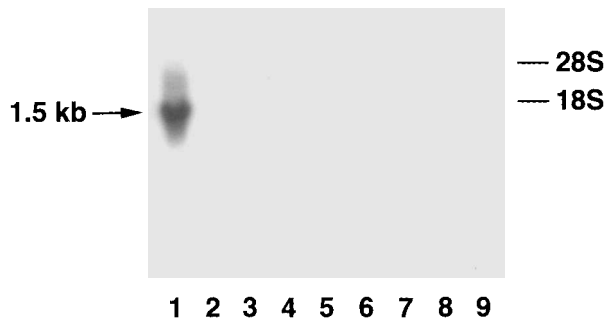
Fig. 3. Northern blot analysis of RNA from various organs of Bufo japonicus for detection of mRNA for tGCase. Total RNAs of the stomach (lane 1), brain (lane 2), kidney (lane 3), large intestine (lane 4), liver (lane 5), lung (lane 6), olfactory epithelium (lane 7), pancreas (lane 8) and small intestine (lane 9) were hybridized with the radiolabeled tGCase cDNA. The amount of the applied RNA was 15 \mu g in each case except for the stomach, where 5 \mu g RNA was applied.

Comparison of the amino acid sequence between the putative toad gastric chitinase (tGCase) and known vertebrate chitinase family proteins revealed homologies of 75.9, 70.3, 52.1 and 50.2% with mouse AMCcase, bovine CBPb04, toad pancreatic chitinase and human chitotriosidase, respectively. Like these vertebrate chitinases, this putative tGCase was predicted to contain an N-terminal catalytic domain and a C-terminal chitin-binding domain (Fig. 2).