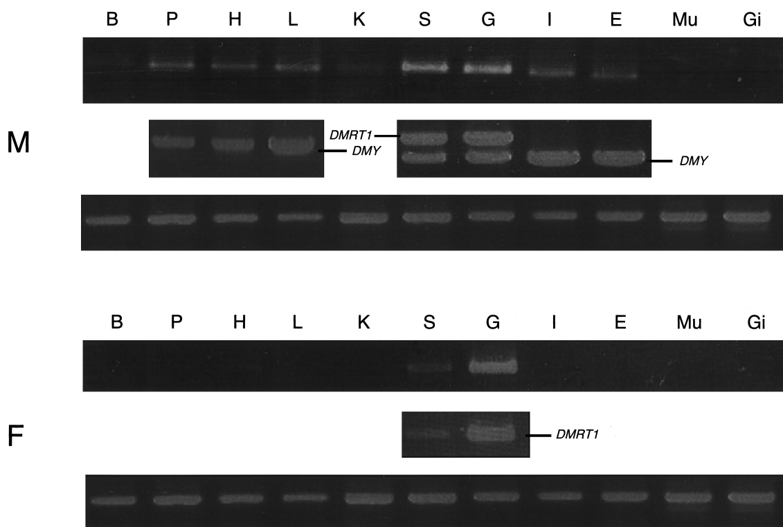
Fig. 3. RT-PCR of DMY and DMRT1 in various tissues of sexually mature medaka. Samples from males (M) and females (F). Top: Before enzyme digestion. Middle: After enzyme digestion. Bottom: PG04 control. B, brain; P, pituitary; H, heart; L, liver; K, kidney; S, spleen; G, gonad; I, intestine; E, eyes; Mu, muscle; Gi, gill.