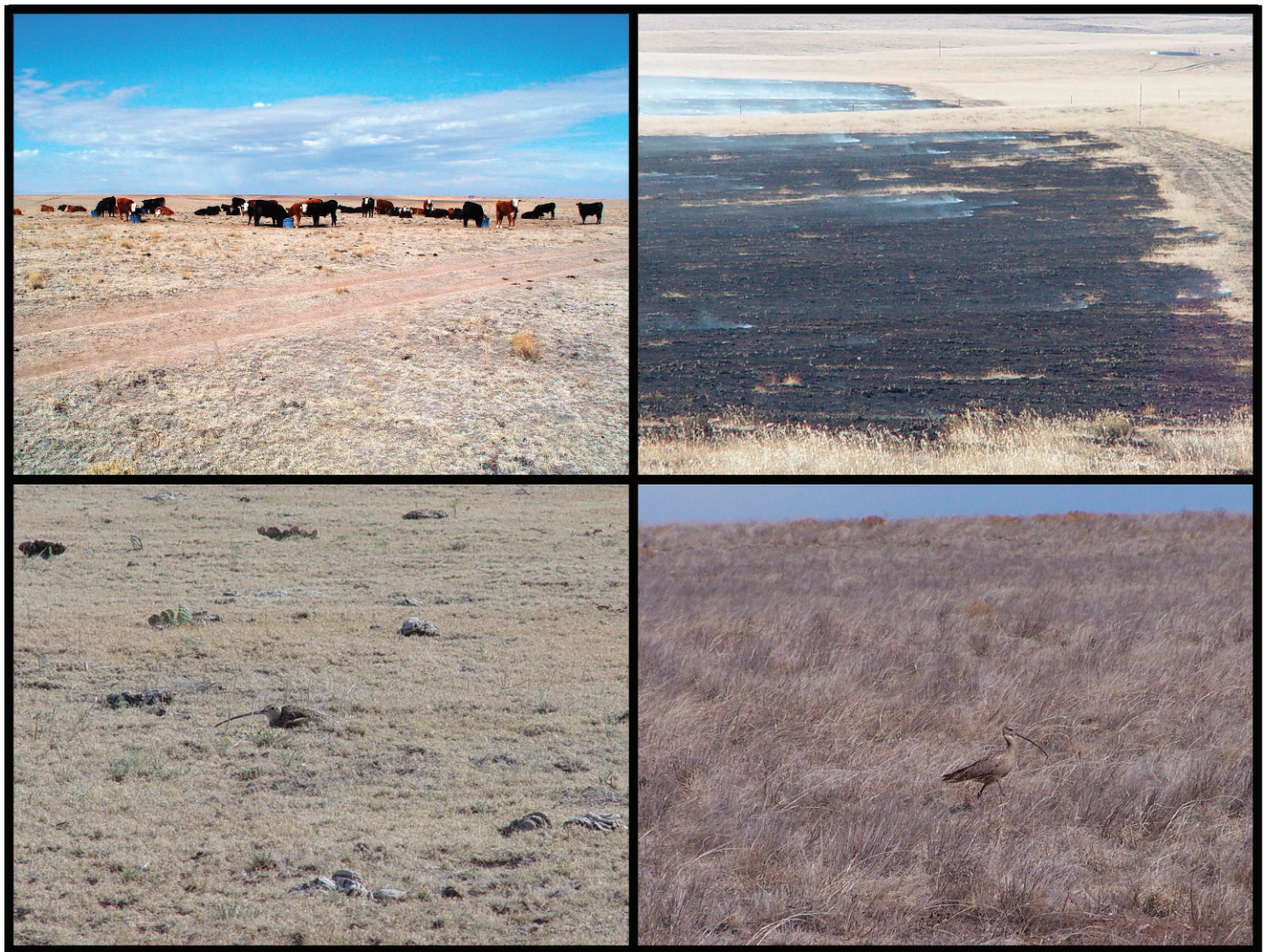
Figure 2. Example of within-pasture scale heterogeneity management through modifying livestock behavior by (upper left) strategic placement of supplemental feed (photo credit: Mary Ashby); (upper right) example of within-pasture scale heterogeneity management through patch burning in shortgrass steppe (photo credit: Mary Ashby); and (bottom left) examples of nesting habitat (photo credit: David Augustine) of long-billed curlew with low vegetation structure and prevalence of bovid fecal piles for concealment, and (bottom right) foraging habitat (photo credit: Cedric Selby) in midheight grassland.

(area furthest from water) can result (e.g., Adler and Hall 2005), commonly called the piosphere effect (Lange 1969), and provide a suite of needed habitats for this species. At the among-pasture scale, varying intensities and/or seasons of use, including deferment and/or rest might be sufficient to create differences in vegetation structure between pastures, thereby increasing edge effects.