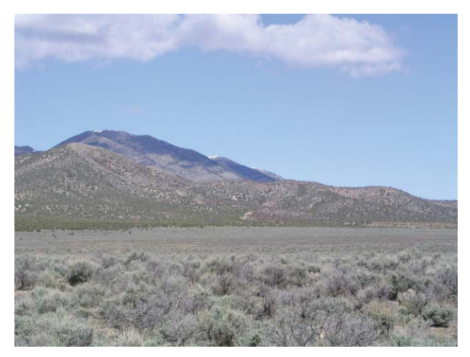
Sagebrush steppe and pinyon-juniper woodland.

fuel abundance and continuity. Consequently, fire frequency was higher in sagebrush types with greater productivity and during periods of increased precipitation.<sup>2,7</sup> More locally within sagebrush types, fire return intervals in sagebrush shrublands were likely determined by topographic and soil effects on productivity and fuels, and were also highly variable.<sup>8</sup> Salt-desert shrublands and desert scrub rarely if ever burned due to inherently low productivity and fuels loads.<sup>9</sup>