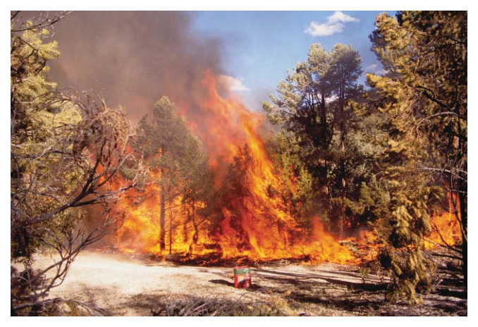
Use of prescribed fire in pinyon-juniper woodland.

The probability that a given shrubland will transition to woodlands, to nonnative annual grasses, or both is linked to three ecological concepts: ecological resistance, ecological resilience, and thresholds.20 Ecological resistance is the degree to which a community maintains itself over time despite the introduction of invasive species. Ecological resilience describes the ability of a community to return to its predisturbance and, presumably, its pre-invasion state after a disturbance. Threshold crossings occur when a community does not return to the original state via natural processes following disturbance, but requires active management to restore the original state.<sup>21,22</sup> Research and management projects aimed at understanding the factors that influence ecosystem resistance to invasive species and resilience after fire and other types of disturbance are needed both to prioritize areas for restoration and other management activities, and to develop effective treatments for different types of ecosystems.<sup>20</sup> Defining the specific soil characteristics, vegetation composition, and abundance of different ecological types that are likely to result in recovery versus threshold crossings can be used to refine restoration and other management strategies. Further, increasing our