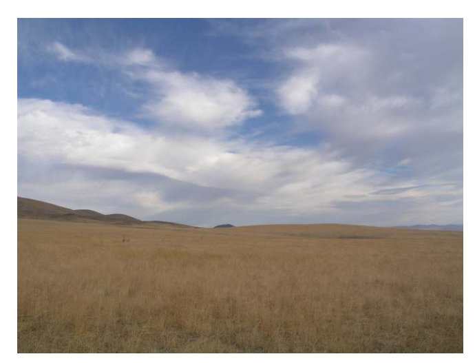
Sagebrush steppe converted to cheatgrass (Bromus tectorum).