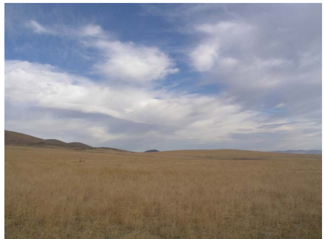
Sagebrush steppe converted to cheatgrass ( Bromus tectorum ).