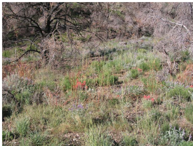
Recovery of sagebrush steppe following prescribed fire.

understanding of the effects of different management approaches, like biocontrol agents and prescribed or managed fire, is needed to effectively manage both wildfire and invasive species. For example, in pinyon–juniper ecosystems, it is necessary to identify methods for managing expansion that promote native recovery rather than conversion to an undesired state.