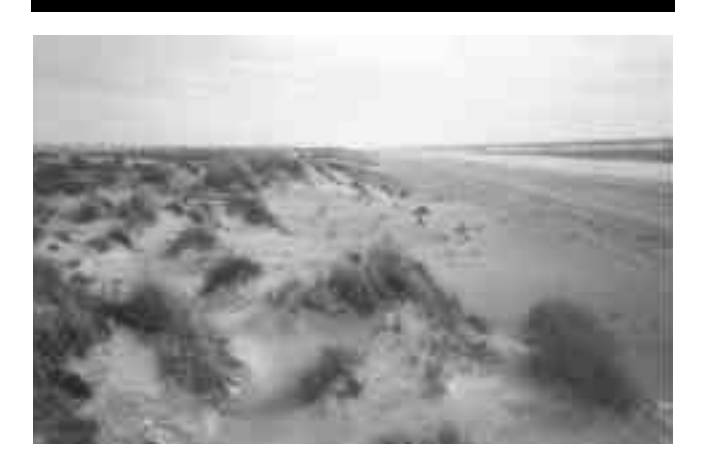
Figure 13. Dune blow-outs in Isla Cristina beach (Huelva, Spain)

La Lanzada isthmus is one of the most emblematic beaches in the province of Pontevedra (North Atlantic façade). The direct burden on the beach caused by tourism and a bad commuting road system on the foredune itself made the whole dune system and beach very vulnerable. The goal of the dune restoration project was very challenging trying to both eliminate the main dune problem (the road) and reinforce the primary frontal dunes. The demolition of the existing public road across the dunes and the construction of an alternative road further inland from dunes was a controversial social issue that was, in the end, well accepted. Willow sand fencing and transplanted vegetation was used to rebuild the dune areas damaged by the road. Damage to dunes from pedestrian traffic was avoided by the use of elevated walkovers constructed parallel and perpendicular to the beach. Selective areas were