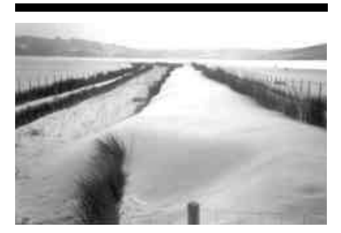
Figure 7. A detail of dune restoration in Liencres spit (Cantabrian, Spain)