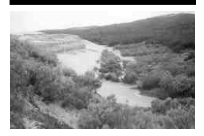
Figure 17. A view of Valdevaqueros backdune restoration (Cádiz, Spain)

(approximately 150,000 m³/year eastward) by the Carreras and Guadiana entrance river jetties.