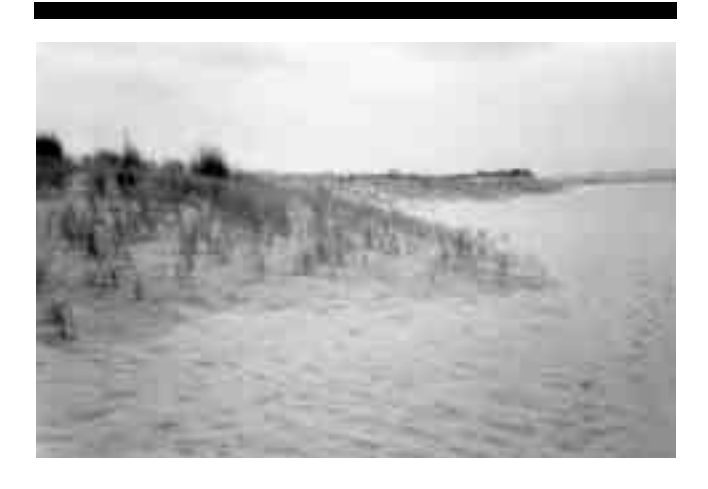
Figure 14. Grazing in Isla Cristina beach (Spain).