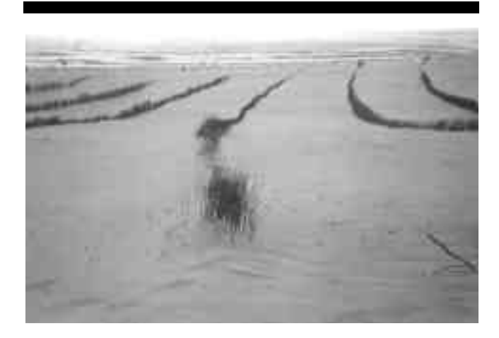
Figure 18. A view of Valdevaqueros accreted foredune after restoration (Cádiz, Spain)

At present a second phase is being carried out with the aim of re-establishing the natural dune equilibrium based on the experimental results obtained in the first project phase. Also an integrated dune management program is under study in order to minimize human negative impact on the whole dune system.