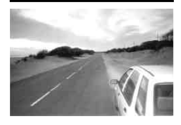
Figure 2. Existing road alongside La Bota beach (Huelva, Spain), Gómez-Pina 1997.