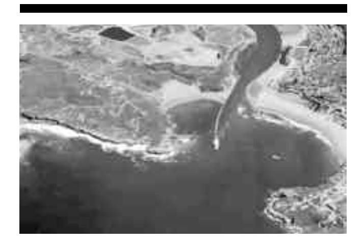
Figure 9. An aerial view of Cuchía beach (Cantabrian, Spain)

Figure 9 shows an aerial view of Cuchía beach and Suances estuary. A panoramic of Cuchía beach after rehabilitation is depicted in Figure 10.