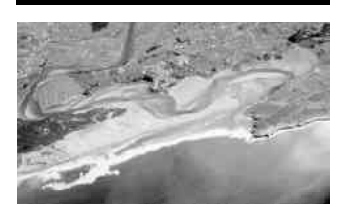
Figure 6. An aerial view of Liencres spit (Cantabrian, Spain) after breaching.