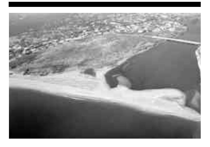
Figure 19. An aerial view of Guadalquitón estuary after restoration (Cádiz, Spain)