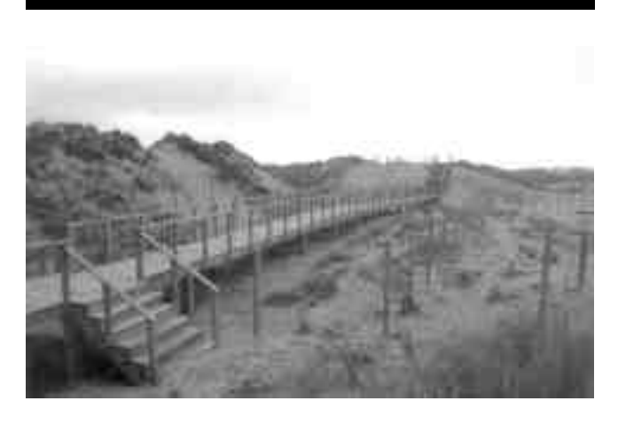
Figure 8. Dune walkover and fencing in Liencres spit (Cantabrian, Spain)

Figure 6 depicts an aerial view of Liencres spit after dune breaching. In Figure 7 sand accumulation caused by willow fences can be seen. Elevated dune walkovers and fencing are shown in Figure 8.