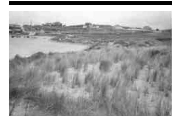
Figure 10. Cuchía beach (Cantabrian, Spain) after dune restoration