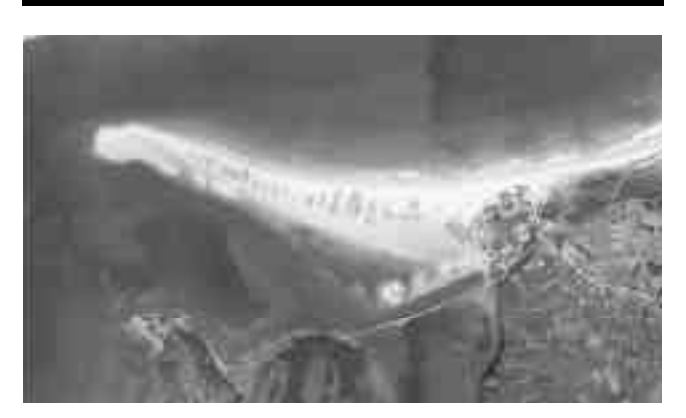
Figure 3. An aerial view of Somo spit (Cantabrian, Spain) before dune restoration.

The Somo spit, located in Santander (Cantabrian sea), is a very distinctive spit formation in Santander bay. The spit dimensions are approximately 2,500 m long by 150 m wide,. In the central section a dune system is formed, acting as a buffer against high-energy storm waves, preventing or delaying intrusion of water and sediment into inland areas. This natural spit formation has been subjected to important