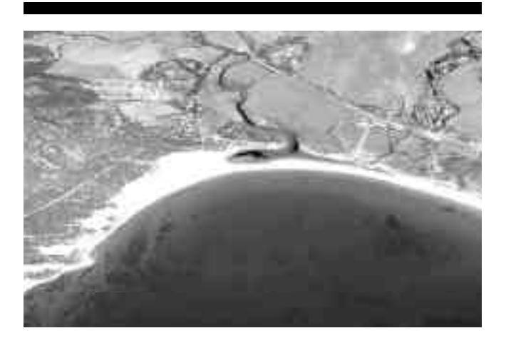
Figure 16. An aerial view of Valdevaqueros cove (Cádiz, Spain)

The relatively high longitudinal net sediment transport along the Huelva coast (up to 400,000 m³/year eastward) together with littoral drift interruption by the harbour entrance jetties, decrease sediments by river discharge and urbanisation developed too close to the beach generally expose Huelva beaches and foredunes to high erosive rates. Isla Cristina beach is one of the representative Huelva tourist beaches showing beach and foredune erosion due to the conjunction of the aforementioned causes and in particular to the interruption of the littoral drift