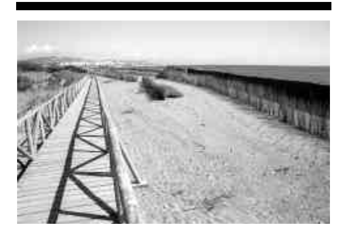
Figure 20. A detailed view of Guadalquitón dune restoration (Cádiz, Spain)