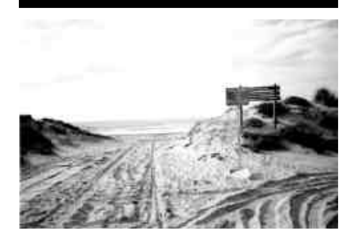
Figure 1. Typical dune breaching in La Bota (Huelva, Spain), Gómez-Pina 1997

Figures from GÓMEZ-PINA(1999) are representative of dune degradation in La Bota beach (Huelva). Figure 1 shows a typical dune breach caused by off-road vehicles and human trampling. Figure 2 depicts the existing public road, crossing the foredunes longitudinally. The removal of this road is part of a very ambitious integrated dune management project being carried out by the National Spanish Coast Directorate, Ministry of Environment.