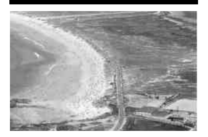
Figure 11. La Lanzada beach (Pontevedra, Spain) before dune restoration