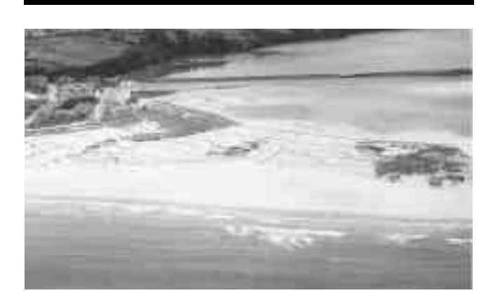
Figure 4. An aerial view of Somo spit (Cantabrian, Spain) after dune restoration.

Liencres spit, located in the mouth of the Pas river and is one of the most important spit formations in the Cantabrian sea, not only for its dimensions but also for its natural and ecological value. The Liencres' wide dune system has suffered a continuous process of degradation due to former extensive sand mining, excessive tourist pressure and also from the occurance of several unfavourable wind, tides and storm events. As a result, the seaward dune face was undermined and collapsed, loosing vegetation and becoming very vulnerable. Dune restoration works ended in 1999 consisting, as in Somo spit, of the use of sand trappers, transplanted vegetation, fencing, walkover construction and educational posters.