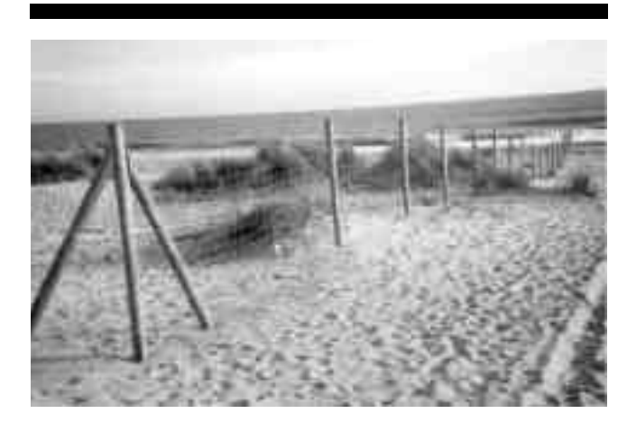
Figure 15. Dune fencing and revegetation in Isla Cristina beach (Huelva, Spain)