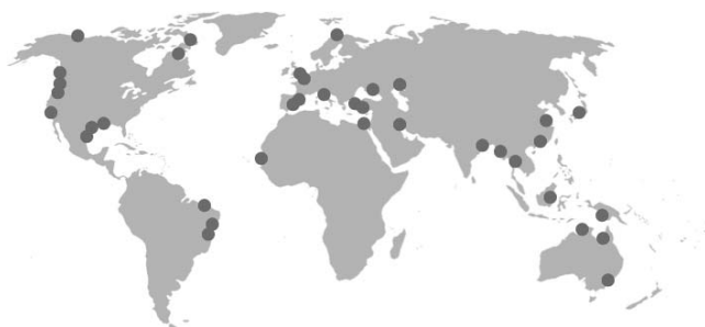
Figure 1. Location of the deltas aged by Stanley and Warne (1994).

determined by coral dating) to identify a SLR tipping point of delta initiation.