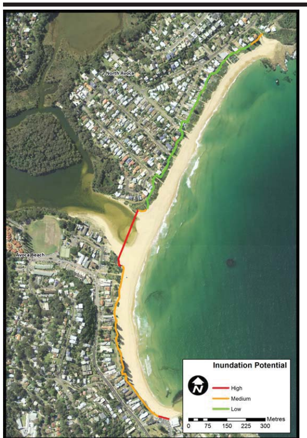
Figure 3. Map showing Avoca site with level of runup inundation potential shown for the 5y ARI case.

Examining the case of the Avoca site and using the 5y ARI values it can be seen (Figure 2) that the South sector dune field is between 3-5 m elevation and E_R is \sim 4.6 m resulting in the sector generally being classified as having Medium runup inundation potential. The exception in this sector is the far southern corner of the beach where runup inundation potential is high. Here a carpark has replaced the dune field. The Central sector includes the entrance to Avoca Lake with very low elevation and thus classified as High potential, however the remainder of the sector consists of a high ( E_D > 6 m) dune field classified as Low potential since E_R in this sector is \sim 4.6 m. Likewise in the North sector the high dune field ( E_D > 6 m) results in a Low potential classification generally despite E_R being larger ( \sim 4.9 m) in this sector, with the exception of a Medium potential area ( E_D < 5 m) in the far north.