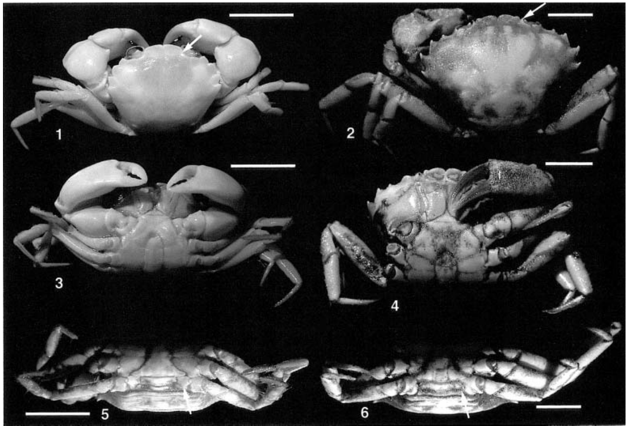
Figure 2. Comparison of Eucratopsinae (E) with Pseudorhombilidae (P), highlighting important differences. 1. Eucratopsis crassimanus (Dana), USNM 45950, arrow indicates lack of intraorbital spine on orbital margin (E). 2. Euphrosynoplax campechiensis Vazquez-Bader and Garcia, USNM 267608, arrow indicates intraorbital spine on orbital margin (P). 3. Eucratopsis crassimanus (Dana), male, USNM 45950, ventral surface (E). 4. Euphrosynoplax campechiensis Vazquez-Bader and Garcia, male, USNM 267608, ventral surface (P). 5. Cyrtoplax spinidentata (Benedict), USNM 82158, male, arrow indicates large portion of somite 8 visible and abdomen not touching coxae of fifth pereopods (E). 6. Euphrosynoplax campechiensis Vazquez-Bader and Garcia, male, USNM 267608, arrow indicates that very little of somite 8 is visible and that somite 3 of the abdomen does touch the coxae of the fifth pereopods. Scale bars equal to 1 cm.

topsinae is consistently higher than in the Pseudorhombilidae, although each set of ratios shows a small amount of overlap. At present, use of these ratios appears to be the best means of distinguishing the two taxa in the fossil record, because the major differences between extant forms are in the morphology of the pleopods (Hendrickx, 1998).