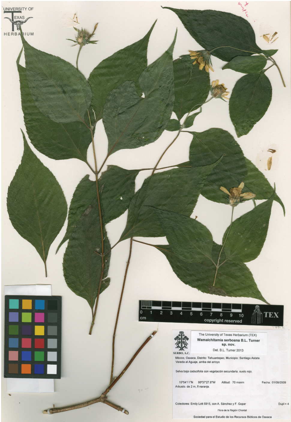
FIG. 2. Wamalchitamia serboana (Holotype).