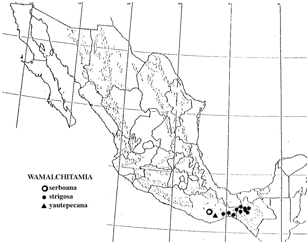
FIG. 3. Distribution of Wamalchitamia serboana , W. strigosa , and W. yautepecana .

This species is known to me only by the specimens cited by Strother (1991).