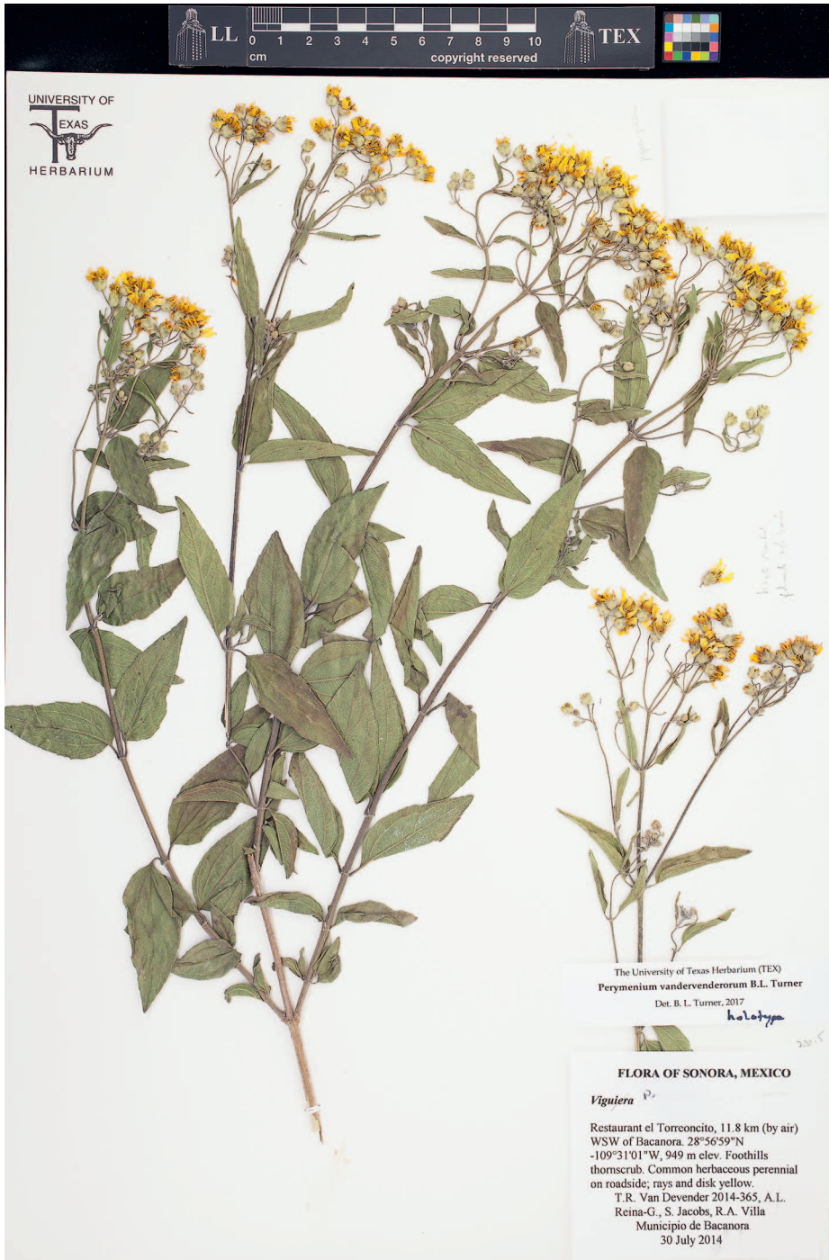
FIG. 1. The type specimen of Perymenium vandevenderorum B.L. Turner located at TEX.