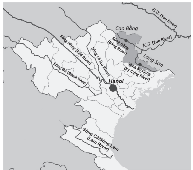
Fig. 1. Map of Northern Vietnam. All 16 localities are situated in darker area in Lang Son and Cao Bang provinces.

Fish were photographed, preserved in 5% formaldehyde and then stored in 70 % Ethanol. Identification of loach species follows Kottelat (2001) and Freyhof & Serov (2000, 2001).