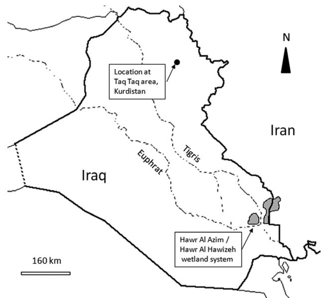
Fig. 1. Location of the Hawr Al Azim/Hawr Al Hawizeh wetland system on both sides of the Iraqi-Iranian border and the location of the River Nal Zab al Saghir, Taq Taq area in Kurdistan.

Skins from two otters were collected in the wild in November 2008. The first otter was found dead at Taq Taq area (on the River Nal Zab al Saghir) in Kurdistan, northern Iraq (N 35° 53', E 44° 37'; Fig. 1). The second was purchased from a hunter who killed the animal on the Iraqi side of the Hawizeh Marshes (N 31° 37', E 47° 43'; Fig. 1). Based on morphological and phenotypic characters (i.e., dark, smooth and