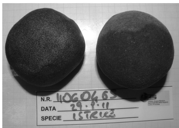
Fig. 1. Phytobezoars found in the stomach of a female adult crested porcupine.

Georges-Louis Leclerc de Buffon (1799) mentioned the presence of bezoars in crested porcupine, without speculating about the structure and the possible functions.