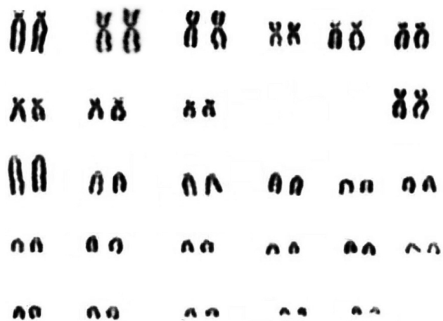
Fig. 2. Karyotype of a female of 2n = 54S cytotype from Saimbeyli.

Two new cytotypes of Nannospalax xanthodon with