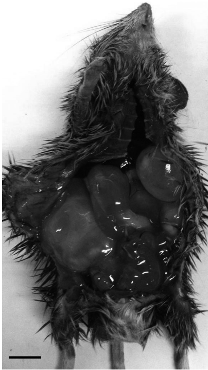
Fig. 1. The studied wood mouse ( Apodemus sylvaticus ), from the Serra Calderona Natural Park (Comunitat Valenciana, Spain), before dissection, showing the presence of swellings in the abdominal region. Bar: 1 cm.

the restructuring of the biological cycle in such a way that the regulation of a parasite infracommunity will be conditioned by the direct effects of the perturbation, the changes in host population dynamics and by the pressure exercised by the other infrapopulations as well as climatic conditions (Fuentes et al. 2009). Herein, an unusual case of multiparasitism in a wood mouse, Apodemus sylvaticus , originating from a post-fire regeneration area is described, highlighting the potential relationship between multiparasitism and a perturbed ecosystem.