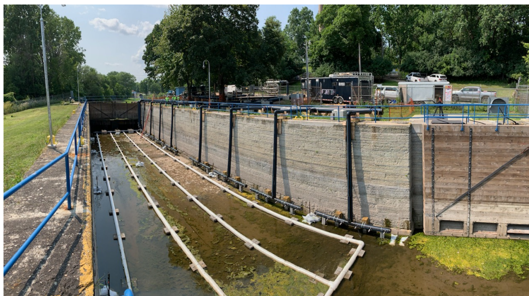
Fig. 4. Installation of an experimental carbon dioxide (CO 2 ) deterrent system at lock #2 on the River Fox near Kaukauna, Wisconsin. Photograph shows gas distribution piping on bottom and side of lock chamber. This system was temporarily installed for research purposes in 2019 to evaluate gas system engineering and performance within navigation lock chambers.

currently exist (Fig. 4; Zolper et al. 2019). One common method uses differential pressures to infuse CO 2 into water. Water from the lock is pumped into a pressurized mixing chamber while CO 2 at a slightly higher pressure is simultaneously injected into the mixing chamber to achieve supersaturated concentrations (e.g. 1,000-2,000 mg/L) prior to being distributed back to the lock. This recirculating process continues until complete mixing and target CO 2 concentrations in the lock are achieved. A second method involves direct gas injection within the application site. Carbon dioxide gas is applied directly into water via aeration using microbubble porous diffusers. Liquid CO 2 storage systems coupled with gas vaporization make either application system viable for large-scale application. Both CO 2 injection methods are used worldwide for wastewater and effluent water treatment processes and have been adapted to control invasive carps (Zolper et al. 2019).