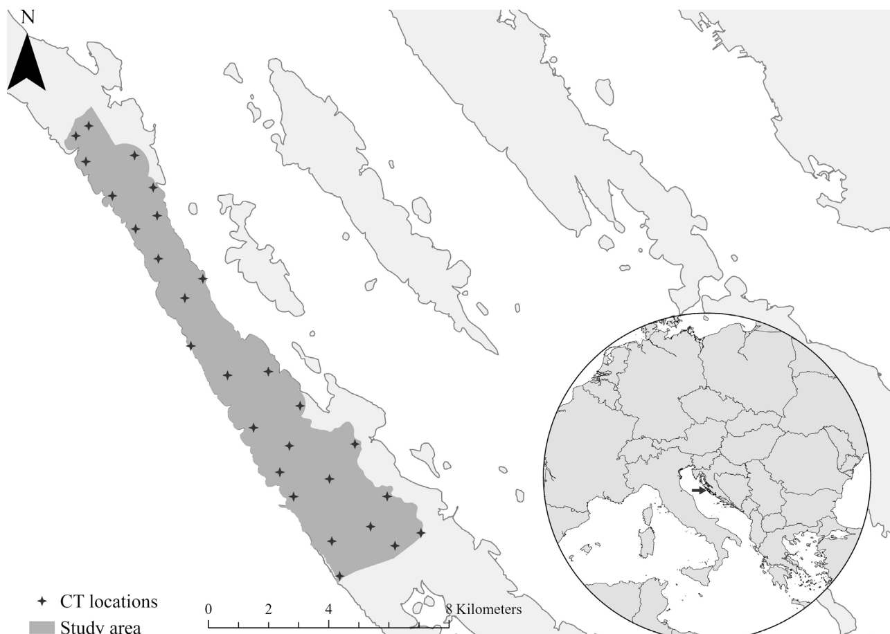
Fig. 1. Study area borders and the camera trap locations.

Data collected using camera traps are increasingly used to study temporal patterns in species and community ecology, including species activity patterns and niche partitioning. These temporal insights are valuable from an ecological perspective and provide insight into human-induced changes in species behaviour and interactions and the resulting effects on niche partitioning and community structure. The increase in studies based on temporal analyses using cameras provides new ecological and applied insights (Frey et al. 2017). Since there is scarce information about stone marten locomotor activity, especially in a Mediterranean island ecosystem without large carnivores, this study aimed to determine the daily and seasonal activity pattern of this small carnivore species using camera traps.