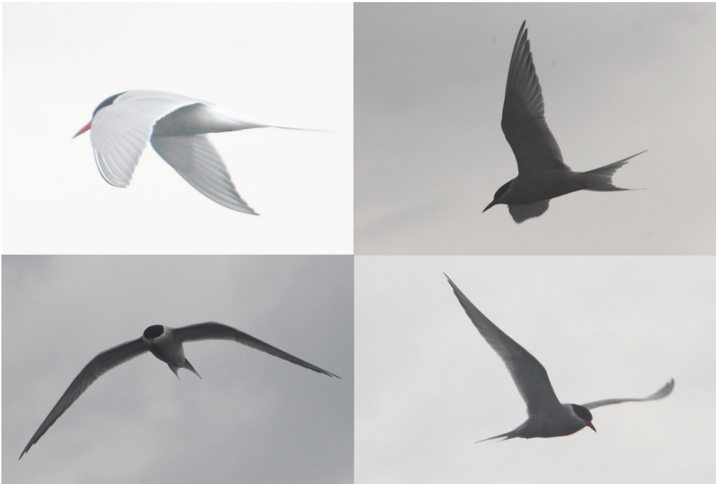
Figure 2. Antarctic Tern Sterna vittata , at sea off Rio Grande do Sul, Brazil (c.34°07.3'S 51°18.7'W), 3 September 2012 (Nicholas W. Daudt)