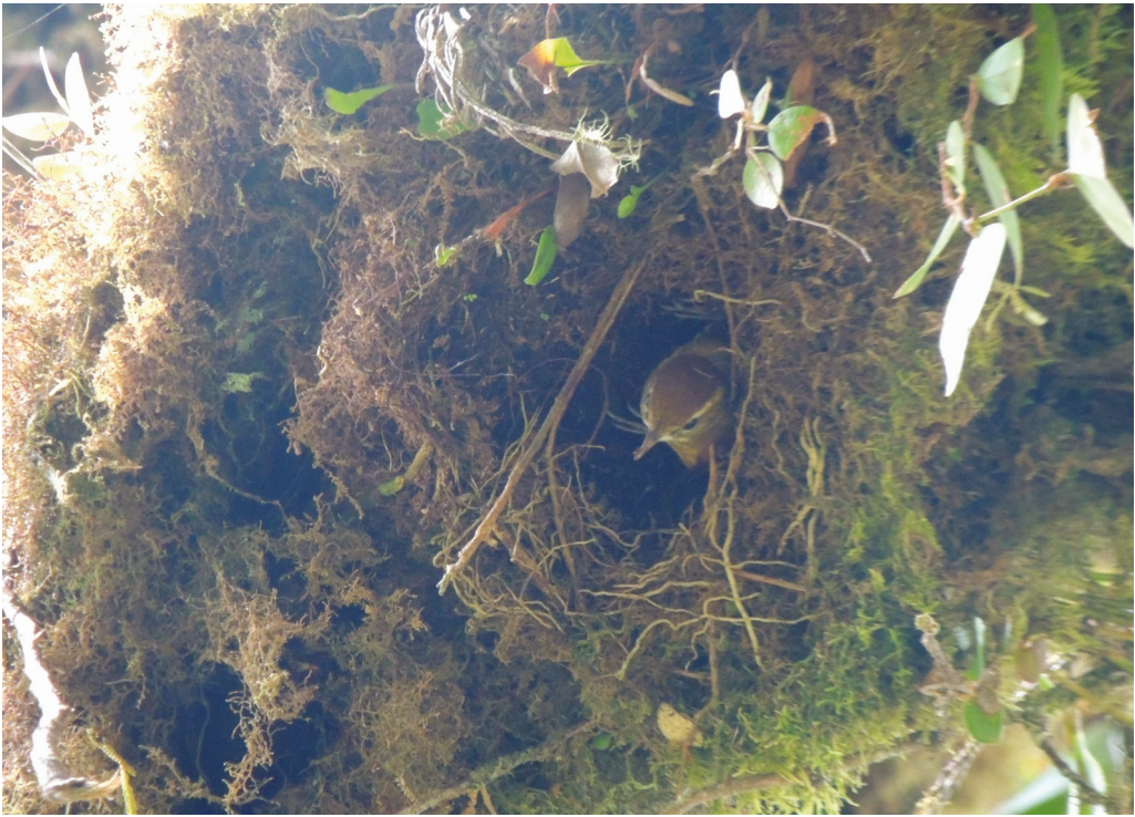
Figure 2. Nest of Ruddy Treerunner Margarornis rubiginosus , collected on June 2015, at Cerro Chompipe, Heredia province, Costa Rica (nest 3) (Ariel A. Fonseca-Arce)

materials of the inner chamber and tunnel, study the wall surroundings and measure the inner chamber dimensions (measurements 7–8, Fig. 3).