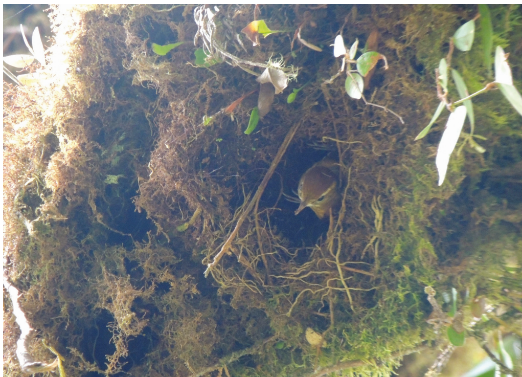
Figure 2. Nest of Ruddy Treerunner Margarornis rubiginosus , collected on June 2015, at Cerro Chompipe, Heredia province, Costa Rica (nest 3) (Ariel A. Fonseca-Arce)

materials of the inner chamber and tunnel, study the wall surroundings and measure the inner chamber dimensions (measurements 7–8, Fig. 3).