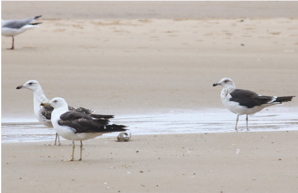
Figure 4. Three Lesser Black-backed Gulls Larus fuscus , Maputo, Mozambique, 16 January 2016, all showing characters of nominate fuscus (Baltic Gull), second-calendar year (left back, partially obscured), subadult (middle) and fourth-calendar year (right) (Gary Allport)

Sources: 1 Brooke et al. (1981) (indicated as 'x' where no counts provided) and Parker (2005); 2 SABAP database; 3 Parker (1999); 4 this study (record in brackets from Bazaruto archipelago).