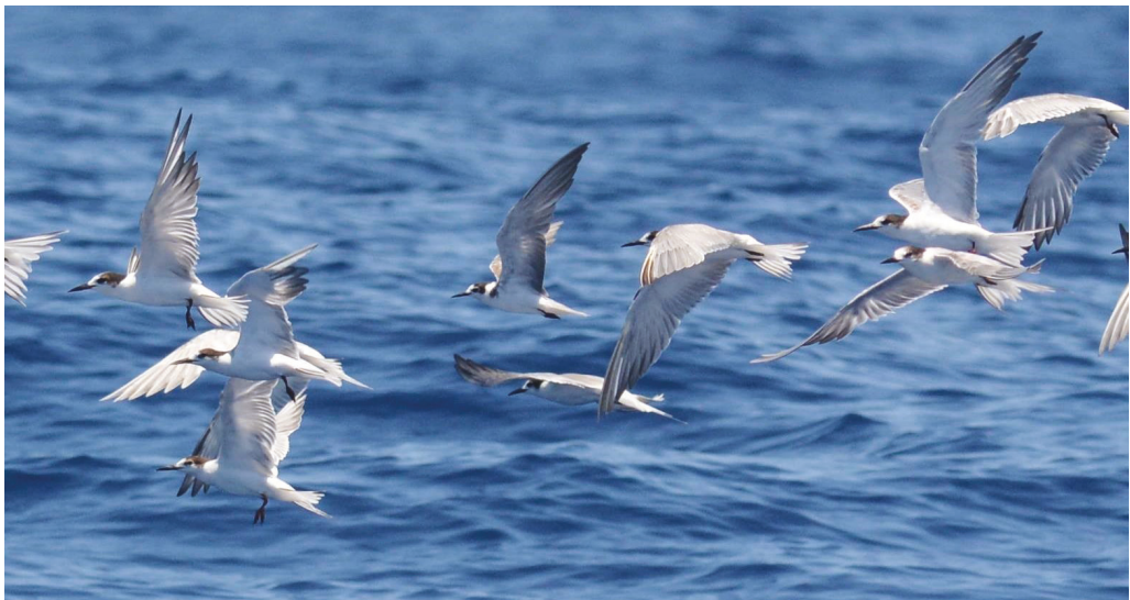
Figure 7. Black Tern Chlidonias niger (centre), Maputo Bay, Mozambique, 31 January 2015

An abundant Palearctic visitor to the southern African west coast in the austral summer, mostly in August–April, but some regularly remain in the austral winter (Brooke & Sinclair 1978, Maclean 1984, Sinclair & Ryan 2003). Uncommon on coasts of South Africa but