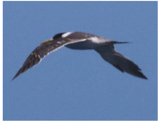
Figure 5. Swift Tern Thalasseus bergii , off Tofo, Inhambane Province, Mozambique, 29 August 2016, possibly of the race velox , showing relatively dark upperwings of a grey tone similar to Lesser Black-backed Gull L. fuscus

T. b. thalassinus breeds on coasts of Tanzania and Kenya, and has much paler upperparts than T. b. bergii , with the grey tone equivalent to Lesser Crested Tern T. bengalensis (see Stevenson & Fanshawe 2002). It is smallest in wing and bill lengths (Table 3) of the first three taxa discussed here. This race has not been confirmed to occur in Mozambique, but it appears probable that T. b. thalassinus is present in at least the northern coastal provinces (see below).