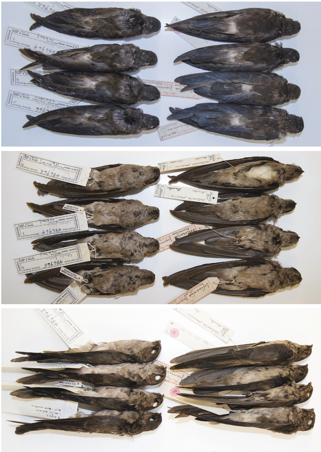
Figure 1. Dorsal, ventral and lateral views of the (USNM 486962) and three paratypes (USNM 486964–966) of Mascarene Swiftlet Aerodramus francicus saffordi (holotype, at left), collected in northern Reunion, in November 1964, compared to four specimens (NHMUK 1844.10.19.3, 1844.10.19.3, 1890.12.16.39, 1890.12.16.40) of A. f. francicus, collected on Mauritius on unknown dates in the 19th century