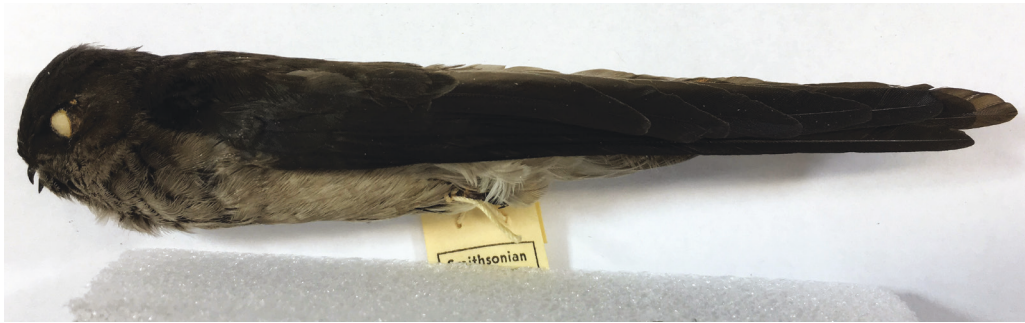
Figure 6. Specimen of Aerodramus f. francicus (UMMZ 210026), collected on Mauritius, in September 1964, showing glossy wings and upperparts

Chapelle, Cirque de Cilaos, in the centre of Reunion (Cheke & Hume 2008). However, at least some caves (potential breeding sites) are almost certainly inaccessible and detailed surveys do not appear to have been attempted, in contrast to the situation on Mauritius (Safford 2013).