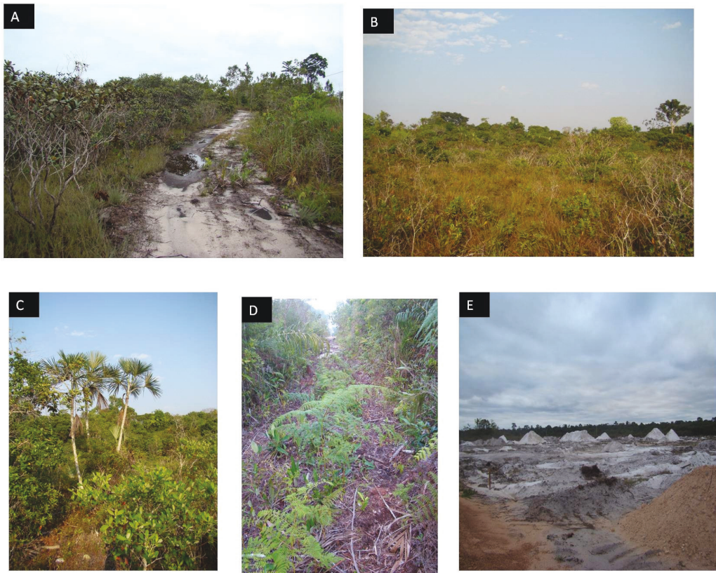
Figure 2. Overview of the white-sand vegetation ( campinarana ) survey area: (A) access road to campinarana , (B) panoramic view of the campinarana , (C) structure of the campinarana highlighting the presence of Mauritiella armata palms, (D) Pteridium sp. fern, (E) area where sand is being commercially mined.

Velho and Abunã), c.30 km from Jaci Paraná in the municipality of Porto Velho, Rondônia (09°21'38.3"S, 64°39'29.2"W; Fig. 1).