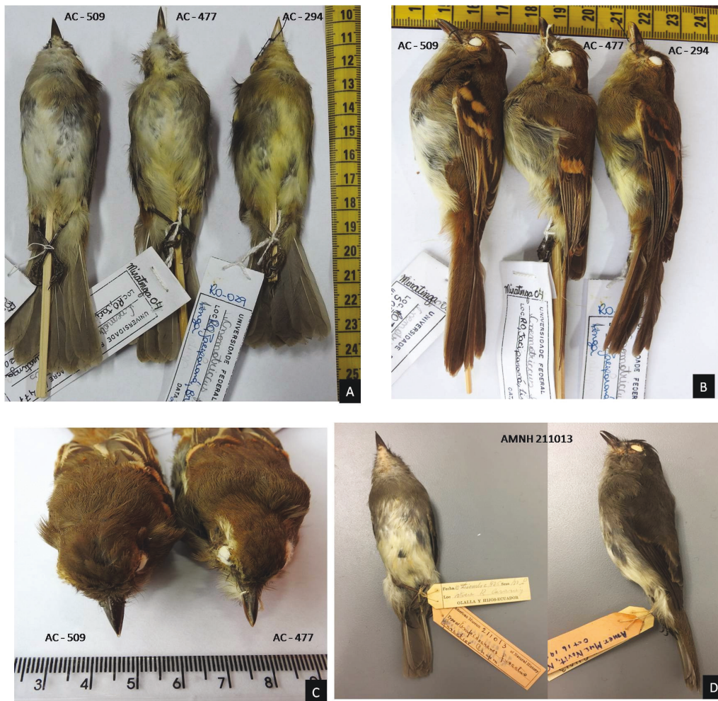
Figure 4. Three specimens of the Fuscous Flycatcher Cnemotriccus fuscatus complex collected in campinarana and deposited at the Universidade Federal do Acre, Rio Branco (UFAC) compared to the holotype of C. f. fuscator in the American Museum of Natural History, New York (AMNH 211013): (A–B) ventral and lateral views of UFAC 509, 477 and 294; (C) front view showing difference between bills of UFAC 477 and UFAC 509 (Edson Guilherme); (D) ventral and lateral views of AMNH 211013 (Paul Sweet). UFAC 294 = C. f. duidae ; UFAC 477 = C. f. bimaculatus , UFAC 509 = C. f. beniensis and AMNH 211013 = C. f. fuscator holotype.

photographed at the edge of campinarana at Miratinga (Fig. 3D). In 2012, the species was seen daily in the same place. This taxon appears to be common in enclaves of campinarana along the BR-364 between Porto Velho and Abunã, in the north-west of the state. It is possible that C. c. diesingii occurs sympatrically with the recently discovered Campina Jay C. hafferi (Cohn-Haft et al. 2013) in campina / campinarana further north, in Amazonas, e.g. in WSV enclaves around Borba (Hellmayr 1910, Wikiaves 2018).