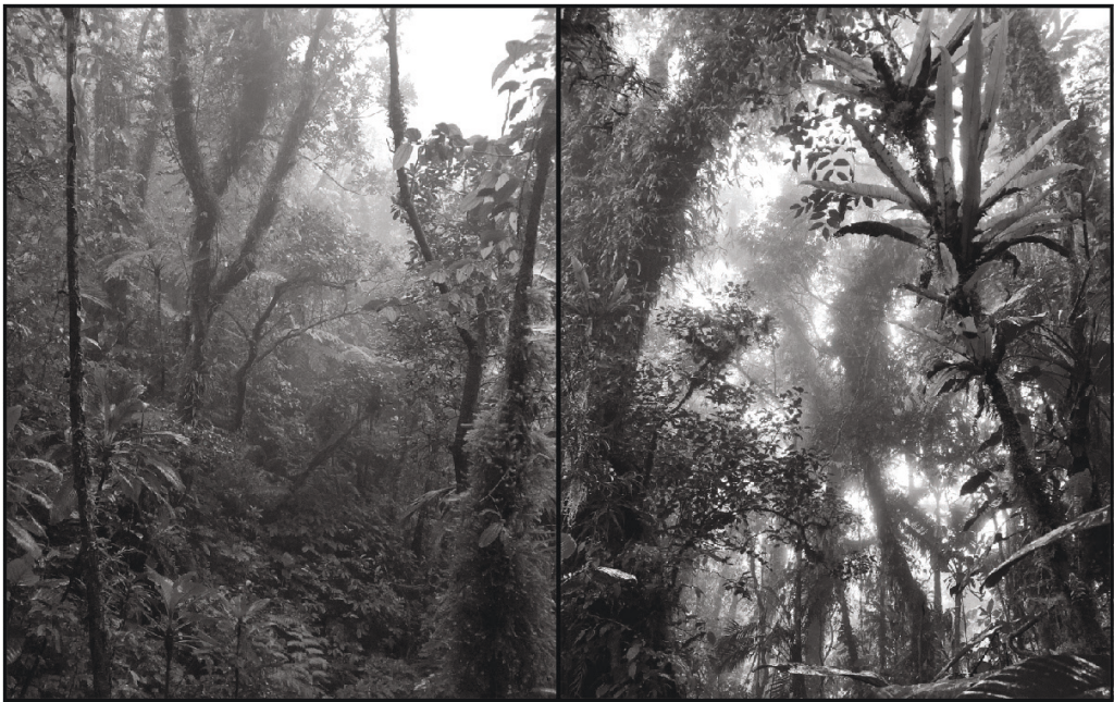
Figure 2. Examples of mossy montane forest on the Kubonitu-Sasari massif, Isabel Island, Solomon Islands

Univ. of New Mexico, and Ecological Solutions Solomon Islands in 2018. The information we present improves our knowledge of distribution, abundance and ecology of birds in the region, and on Isabel.