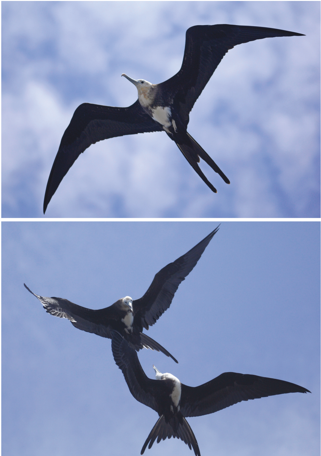
Figure 2. First-year juvenile Great Frigatebird Fregata minor , Fernando de Noronha archipelago, Brazil, 7 March 2008, below being chased by a juvenile Magnificent Frigatebird F. magnificens ; note the tawny wash to the head and neck, complete dark breast-band, and the egg-shaped white belly patch (Robson Silva e Silva)