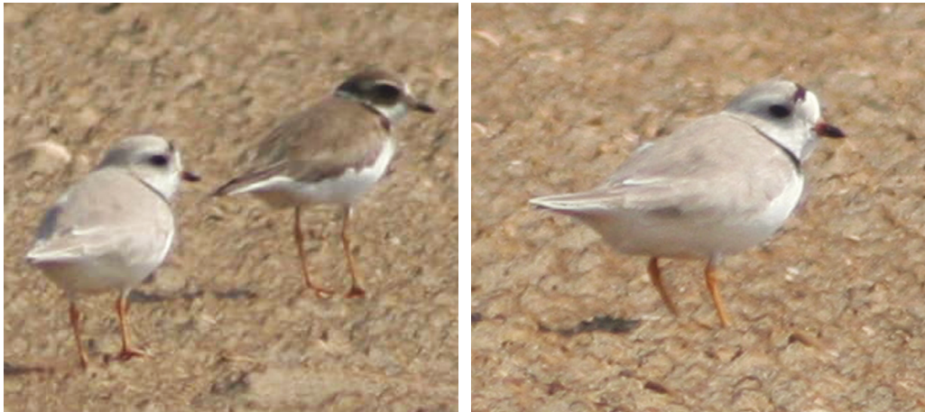
Figures 4–5. Non-breeding Piping Plover Charadrius melodus , Ciénaga de los Olivitos Wildlife Refuge and Fishing Reserve, Zulia, Venezuela, March 2020