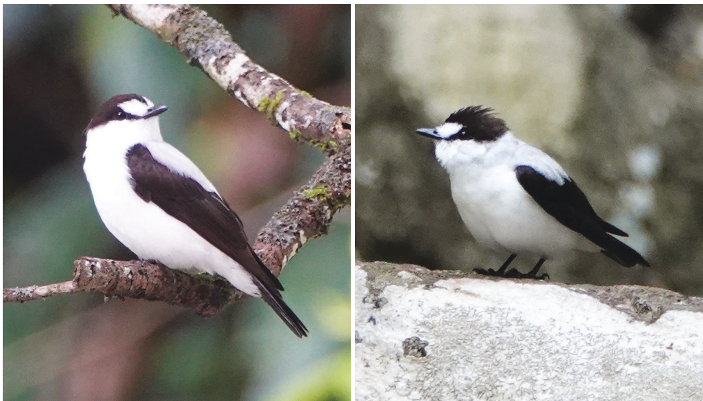
Figure 2. Torrent Flycatcher Monachella muelleriana , Fergusson Island, August 2019 (Jason Gregg)

The birds had a pale grey back, white rump, white throat, breast and belly, black bill and legs, large white forehead spot, and dark brown eyes. The head, wings and tail were black (ML 238404731). No substantial individual variation was observed, even among pairs of suspected males and females, and no individuals matching the description of a juvenile M. muelleriana were observed.