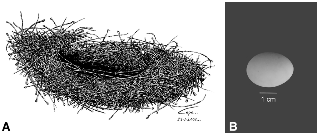
Figure 1. (A) Nest of Striped Woodhaunter Automolus subulatus virgatus , collected at Finca Rafiki, Santo Domingo, Perez Zeledón, San José Province, Costa Rica (nest 2). (B) Immaculate white egg found in the nest

accompanied the nest (MZUCR-H205; Table 1; Fig. 1B) but the specimen label provides no details regarding clutch size or egg development. The size of the hole opened in the egg, however, suggested that it may have contained a well-developed embryo when collected.