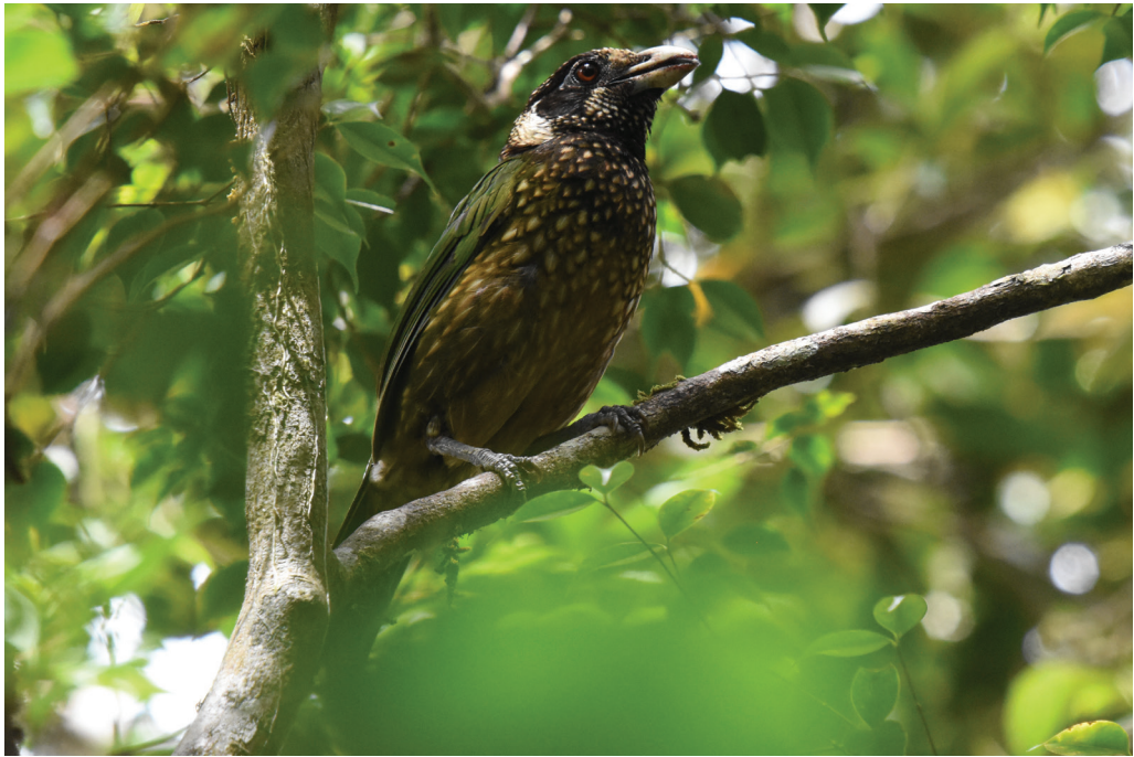
Figure 2. Black-eared Catbird Ailuroedus melanotis , Yapen Island, New Guinea, 8 September 2020