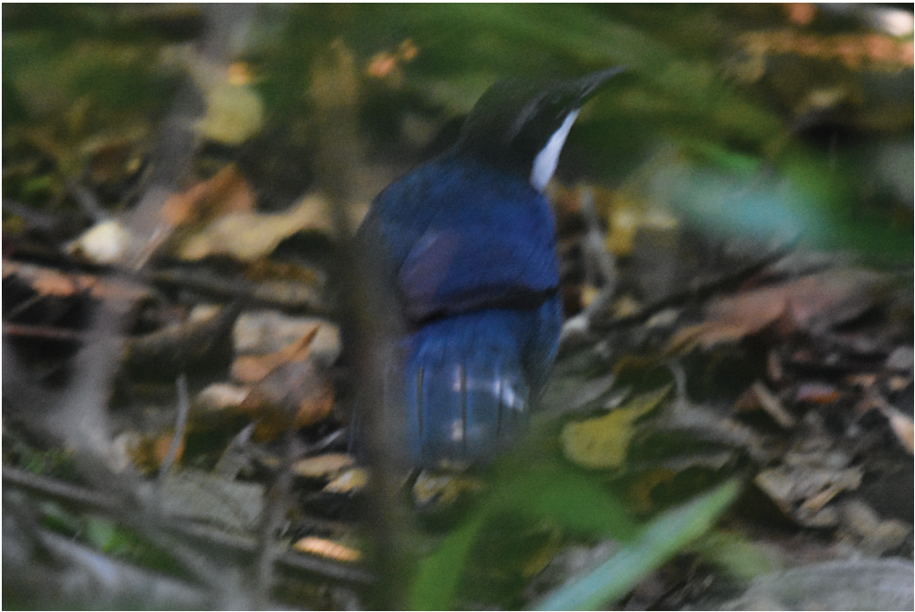
Figure 3. Presumed male Dimorphic Jewel-babbler Ptilorrhoa cf. geislerorum , Yapen Island, New Guinea, 9 September 2020 (Brecht Verhelst)