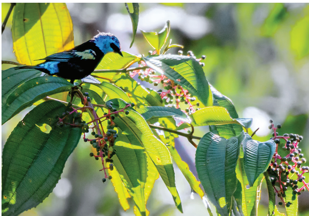
Figure 3. Blue-necked Tanager Stilpnia cyanicollis albotibialis consuming fruits of Miconia minutiflora , rio São Miguel, Goiás, Brazil, December 2020 (Marcelo Kuhlmann)