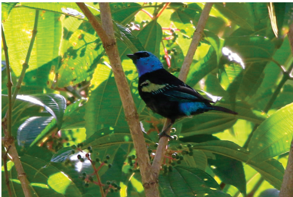
Figure 2. Blue-necked Tanager Stilpnia cyanicollis albotibialis , rio São Miguel, Chapada dos Veadeiros, Goiás, Brazil, December 2020 (Marcelo Kuhlmann)