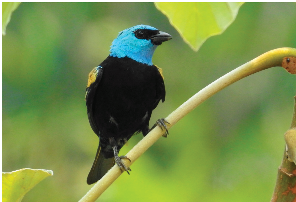
Figure 4. Blue-necked Tanager Stilpnia cyanicollis melanogaster , northern Mato Grosso, Brazil, showing the lack of purple on the throat (Estevão F. Santos)

e.g., Schefflera morototoni (Purificação et al. 2015) and Urticaceae, e.g., Cecropia pachystachya (E. F. Santos pers. obs.).