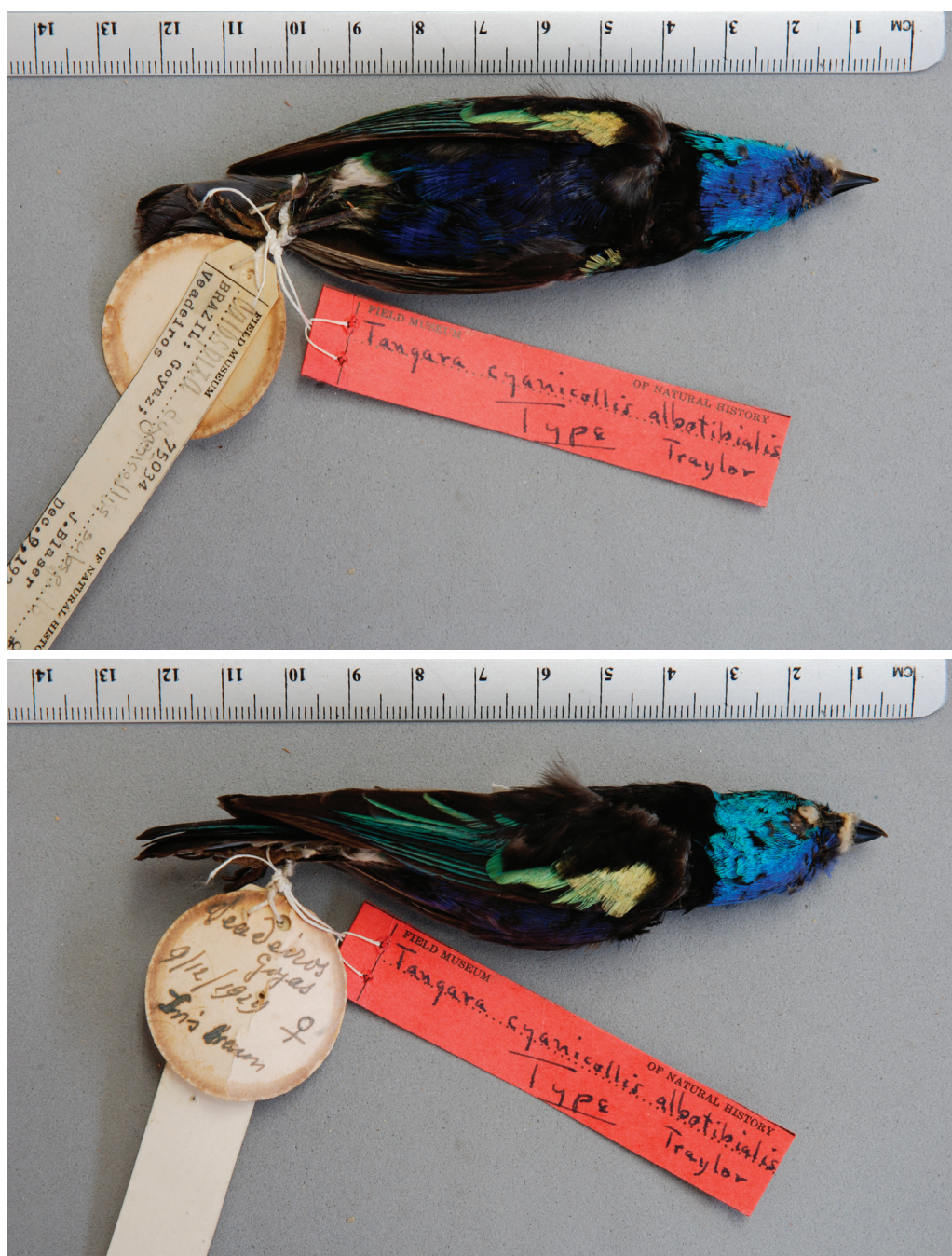
Figure 5. Holotype of Tangara cyanicollis albotibialis (FMNH 75034) collected by José Blaser at Veadeiros, December 1929, in the Field Museum of Natural History, Chicago

lies Fazenda Volta da Serra, where we recorded the tanager. This valley is almost entirely dominated by a tall, semi-deciduous forest of c.450 ha, making it one of the largest forested areas in the Chapada dos Veadeiros (L. Jurgeaitis in litt. 2020).