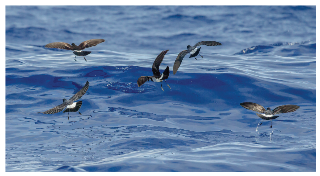
Figure 5. Two Polynesian Storm Petrels Nesofregetta fuliginosa (top and centre left) and three 'classic' Titan Storm Petrels Fregetta [grallaria] titan, Rapa Island, Austral Islands, French Polynesia, November 2019, showing the exceptionally large size of titan relative to other Fregetta, and approaching that of the particularly large Rapa form of N. fuliginosa

Petrels Nesofregetta fuliginosa (Fig. 5). On 24 October, two were seen when approaching Marotiri from the north-east, two were attracted to chum in calm conditions in five hours close to Marotiri and, on departure towards Rapa, four were attracted to the yacht's stern using a fish oil drip. However, c.60 came to chum there on 24 November. Off Rapa observed throughout the survey period, with max. daily counts in each month involving c.90 on 25 October, 120 on 12 November, and >100 on 3 December.