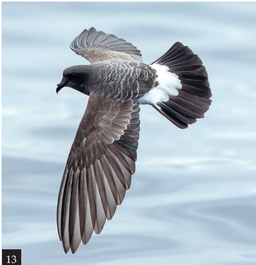
Figures 11-13. White-bellied Storm Petrels Fregetta grallaria. 'Classic titan' (Fig. 11) and 'variant titan' (Fig. 12), Rapa Island, Austral Islands, French Polynesia, December 2019; and 'variant segethi' (Fig. 13) with white fringes like 'classic titan', off the Desventuradas Islands, Chile, February 2017

(Shirihai at al. 2015a, Flood et al. 2017), one at Alexander Selkirk Island, and two at the Desventuradas. Some 'types' may represent seasonally divided populations, and others may warrant taxonomic recognition (HS, H. Diaz & VB work in progress). The variant at the Desventuradas is of particular interest herein; it is the smallest and palest form, and has Titan-like broad white fringes to the scapulars, mantle to rump, and upperwing greater, median and longest lesser secondary-coverts (Fig. 13). HS noted birds that conform to this 'type' in 2003 in the Humboldt Current, far from the Desventuradas, suggesting that it disperses or is migratory (Shirihai 2007: 212).