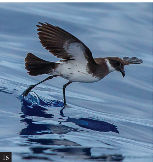
Figures 14-16. Polynesian Storm Petrels Nesofregetta fuliginosa, Rapa Island, Austral Islands, French Polynesia, December 2019. Unique 'bicoloured' plumage, with a blackish-brown hood and broad dark breast-band separated by a white 'cut-throat', narrow white crescent on the tail base, and pale wingbar tipped with buff. We noted two main variations. Some show sparse and narrow dark streaks on the otherwise white body-sides (Figs. 15-16). The number of underwing greater primary-coverts that are dark with white fringes varies from the four outermost (Fig. 15) to all of them (Fig. 16), but in the latter case on the innermost coverts the dark area is paler and the white fringes broader.