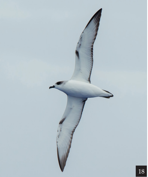
Figures 17-18. Juan Fernández Petrels Pterodroma externa, Rapa Island, Austral Islands, French Polynesia, December 2019. Unlike the White-necked Petrel P. cervicalis complex, externa shows at most only a scruffy white neck collar when these feathers are heavily worn and faded (probably most typical of old juvenile feathers) but, as here, the vast majority lack a collar. The inner underwing has a dark comma-shaped mark at the carpal joint, unlike the extended ulnar bar of the White-necked Petrel complex.