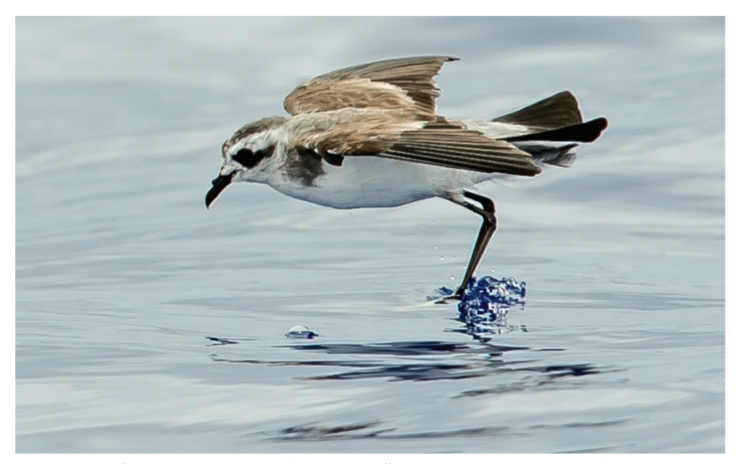
Figure 6. White-faced Storm Petrel Pelagodroma marina, off Rapa, Austral Islands, French Polynesia, December 2019; note combination of sullied pale greyish rump, moderately developed dark breast-side patches, and clean white underparts

of Rapa / Marotiri in September 2006, and a live bird and a dead individual on Rurutu Island in October 2010 (Thibault & Cibois 2017). Seven more records (of ten individuals) are available from across East Polynesia, including an undated sighting for the Line Islands (Thibault & Cibois 2017).