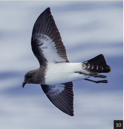
Figures 7-10. 'Classic' Titan Storm Petrels Fregetta [grallaria] titan, Rapa Island, Austral Islands, French Polynesia, November-December 2019. The plumage of 'classic' titan includes broad white fringes to the scapulars, mantle to rump, and upperwing greater, median and longest lesser secondary-coverts. Fig. 7 offers a closer look at the broad white fringes to the mantle to rump feathers, which are abraded and worn off on a few old, browner feathers. The bird in Fig. 8 has undergone head and body moult, with blackish-grey scapulars and mantle to rump, strongly contrasting with the mainly old, browner upperwing-coverts without white fringes. Note the sparse dark streaking on the body-sides in Fig. 8, but lacking in Fig. 10.

occur/s in East Polynesia away from Rapa and Marotiri, but Titan Storm Petrel apparently disperses a significant distance given these two records from much further north and east.