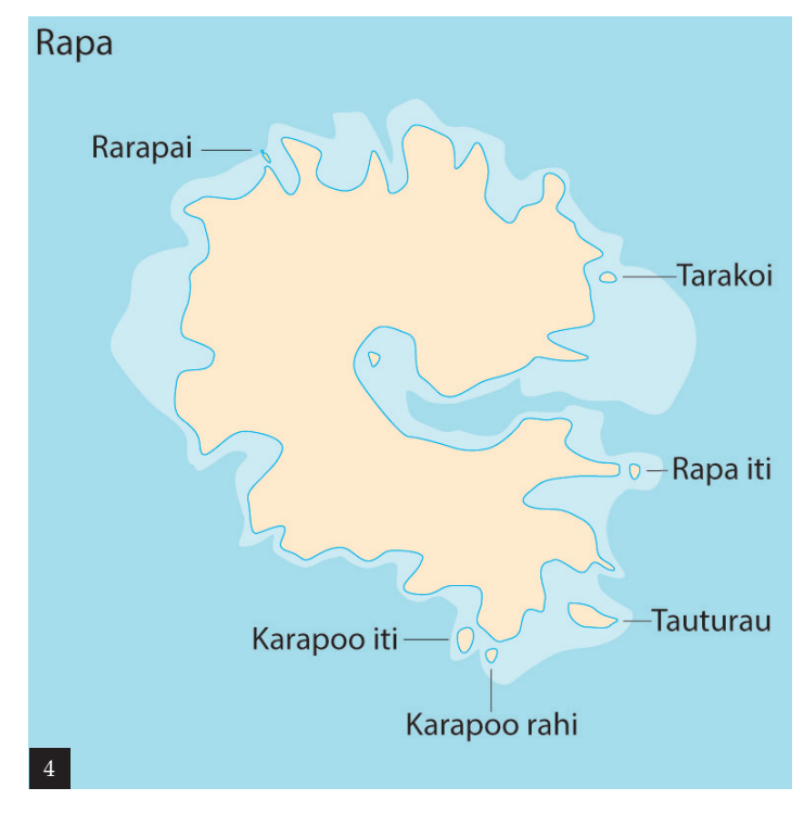
Figures 1-2. Rapa Island, Austral Islands, French Polynesia, December 2019 (Tubenoses Project)