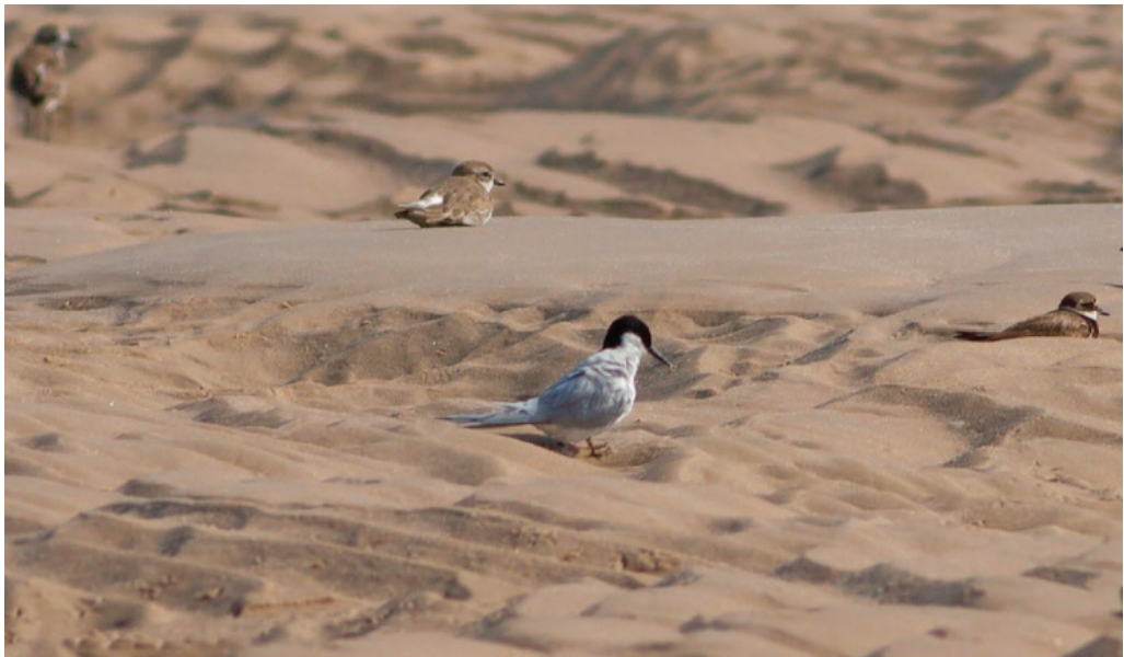
Figure 2. Damara Tern Sternula balaenarum , Rattray's Point, San Sebastian Peninsula, Mozambique, 28 September 2018; diagnostic all-dark cap and nape in breeding plumage (David Gilroy)