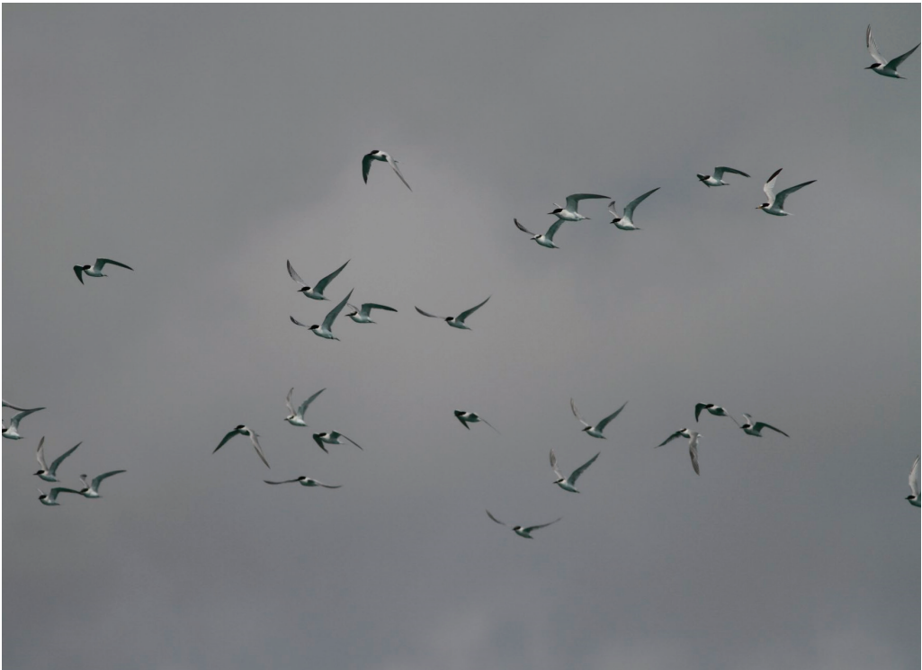
Figure 3. Part of a flock of Damara Terns Sternula balaenarum , including one Saunders's Tern S. saundersi and four Sternula spp., San Sebastian, Mozambique, 30 October 2019

On 2 September 2019 CR found 29 Damara Terns in breeding plumage at Rattray's Point, and DG observed 17+ there on 15 September. With increasing observer interest, larger numbers were found, all loafing on the same area of sandbanks, including 75 on 18 September and a max. 100+ on 24–28 October. Numbers then quickly declined to single figures by mid November. In 2020 none was seen in two visits in February, but 15–25 were recorded in May–July. In 2021 none was seen in January, but 80 in May and 106 in August (Appendix 1).