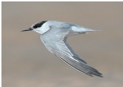
Figure 9. Damara Tern Sternula balaenarum , San Sebastian Peninsula, Mozambique, 9 May 2021. An adult in non-breeding plumage illustrating the dark primary wedge that can be shown in advanced primary moult. The otherwise monotone upperwing, with an ill-defined carpal bar, separates it from Little S. albifrons and Saunders's Terns S. saundersi in similar plumages; note also pale primary shafts

The findings reported here suggest that Damara Tern may occur in the Indian Ocean, conceivably even as far north as Somalia, in April–September, presenting a new identification challenge in the Indian Ocean. Little Terns should be present in small numbers in the region at this time, but these may be second-calendar-year birds in faded, non-breeding plumage, and probably in active moult. Damara Tern is in non-breeding plumage until at least early September and whilst notionally straightforward to separate from Little / Saunders's Terns by the uniform pearl-grey upperparts, fine-tipped black bill and shorter-legged appearance at rest (pers. obs.), these characters are only diagnostic with good views and in direct comparison. A uniform outer wing and lack of contrasting darker outer primaries is a good feature in freshly moulted Damara Terns, but care is needed as birds in post-breeding primary moult can develop a very similar outer wing pattern to Little / Saunders's Terns, since their older outer primaries darken with age and contrast with the growing inner feathers (Fig. 9). Damara Tern tends to have a dusky, ill-defined carpal bar in fresh non-breeding plumage (Hockey et al. 2005) but this fades to leave a more uniform overall tone to the upperwing (pers. obs.). Clear white primary shafts and pale legs are additional features in good views. As yet, there is no good illustration of Damara Tern in non-breeding plumage, the most accurate being in Borrow & Demey (2014).