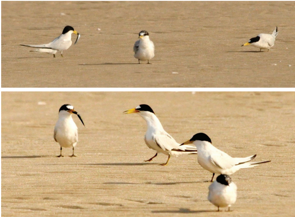
Figure 6. Courtship-feeding by Saunders's Terns Sternula saundersi , San Sebastian Peninsula, Mozambique, 2 September 2019. A. (top) male (left) 'parading', carrying food while female (right) adopts receptive hunched posture. B. (lower) both birds in 'erect posture' after fish presented, with head up and carpal free from body in male; note Damara Tern S. balaenarum in foreground