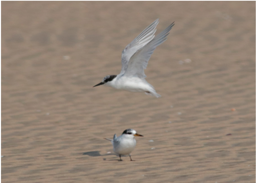
Figure 1. Damara Tern Sterna balaenarum (above) and Saunders's Tern S. saundersi (below; this individual identified from other images), Rattray's Point, San Sebastian Peninsula, Mozambique, 6 August 2018; note fine-tipped all-dark bill, grizzled crown, forehead and above eye, and relatively pale outer primaries of Damara Tern (Gary Allport)