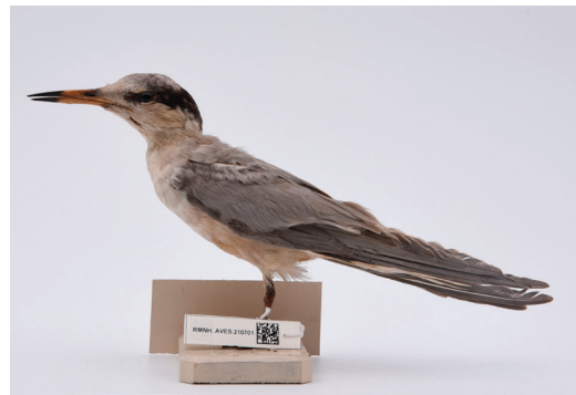
Figure 10. Little Tern Sternula a. albifrons collected at 'Port Natal' (now Durban), South Africa. Mentioned by Schlegel (1863) but no date of collection given. Cited by Saunders & Salvin (1896) as evidence of saundersi occurring in South Africa but lack of black outer primaries and darker grey inner upperwing show this to be a Little Tern (© Naturalis Biodiversity Centre, Leiden)

Naturalis specimen. —Photographed by staff at Naturalis (Fig. 10). There is no collection date, but it appears to be an adult, probably attaining breeding plumage with all-fresh primaries (so had probably recently completed wing moult), and partial breeding head pattern and bill coloration. From these characters, the collecting date is estimated to have been mid February to early April. It has dark primary shafts on the upperside but no clearly darker outer primaries, therefore supporting G. F. Mees' conclusion that this a Little Tern of the nominate race.